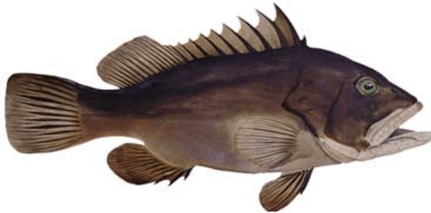
Drawing courtesy: C.S. Mannocho.