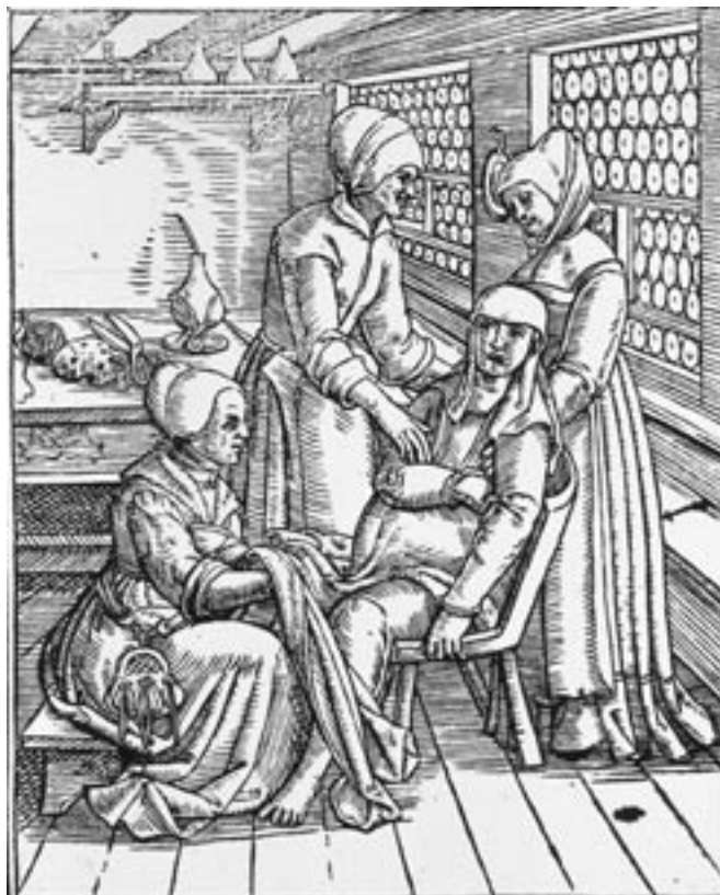
Everything old is new again, apparently— this 16th century woodcut shows an expectant mother in a birthing chair, a device that's making a comeback in the 21st century.

Birthing chairs are now making something of a comeback in modern obstetrics as case-control studies are