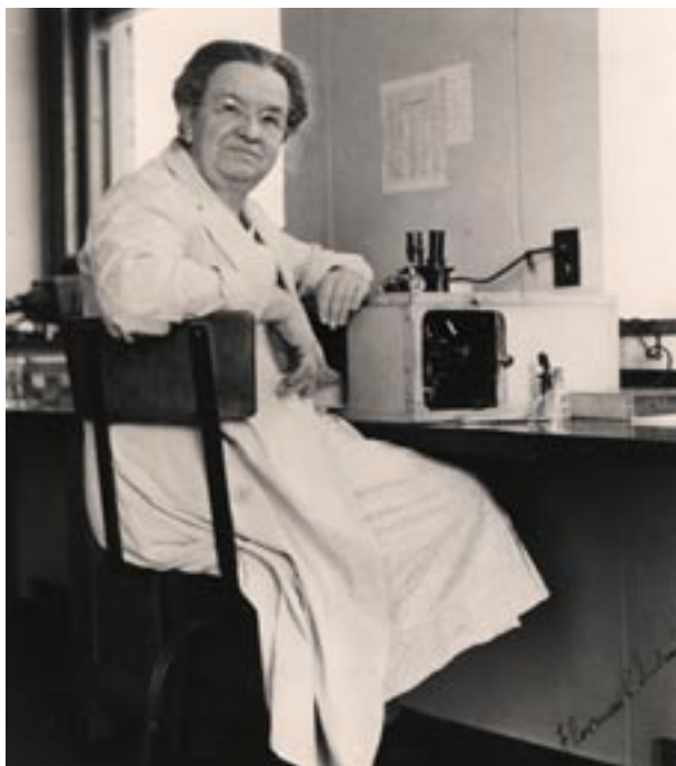
Dr. Florence Sabin at the laboratory bench (between 1925 and 1938).

Profiles in Science ( www.profiles.nlm.nih.gov ), NLM's Web site celebrating 20th century leaders in biomedical research and public health, has added two more luminaries to its archive.