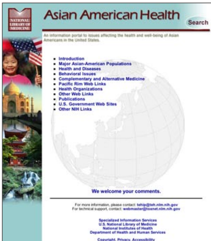
Screen shot of http://asianamericanhealth.nlm.nih.gov .

Asian American Health is the second Web site that the National Library of Medicine has created for special populations. The first, ArcticHealth, was launched in 2001.