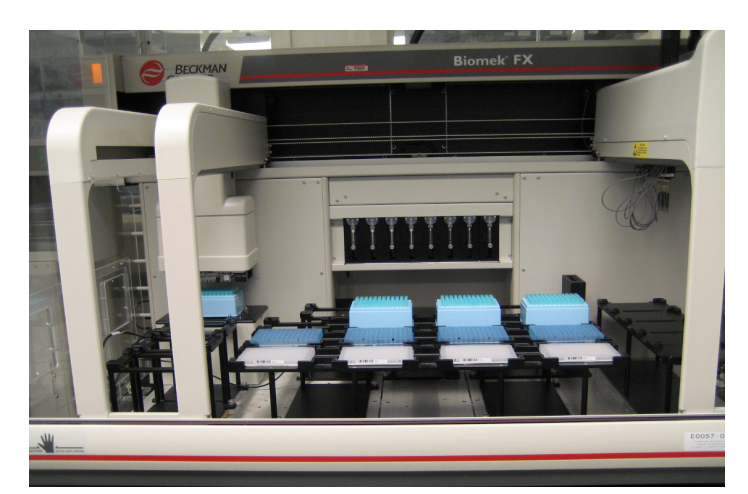
Liquid-handling robotics, like the BioMek FX shown, are the cornerstones of the high-throughput lab.

The Core Genotyping Facility (CGF), located at the Advanced Technology Center in Gaithersburg, functions as a high-throughput genotyping laboratory