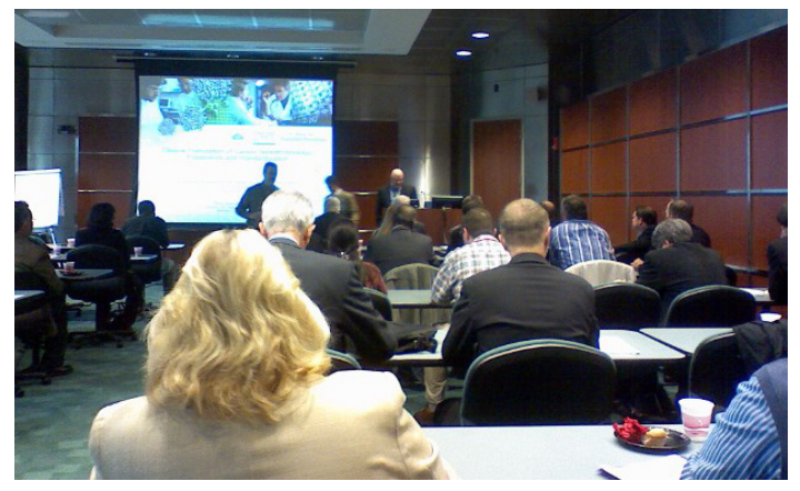
Representatives from ABCC and NCL participated in an international workshop on web-based collaboration at the National Institute of Standards and Technology on October 8–9.

There is increasing recognition of the need to facilitate the development of standard protocols and standard research materials for nanotechnology. Voluntary consensus standards and reference material standards contribute to making the development, manufacturing, and supply of products and services efficient, safer, and