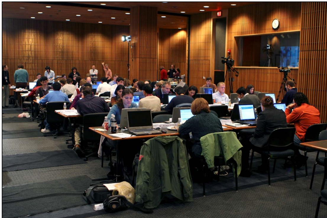
Participants had the opportunity to learn about the technology with hands-on training.