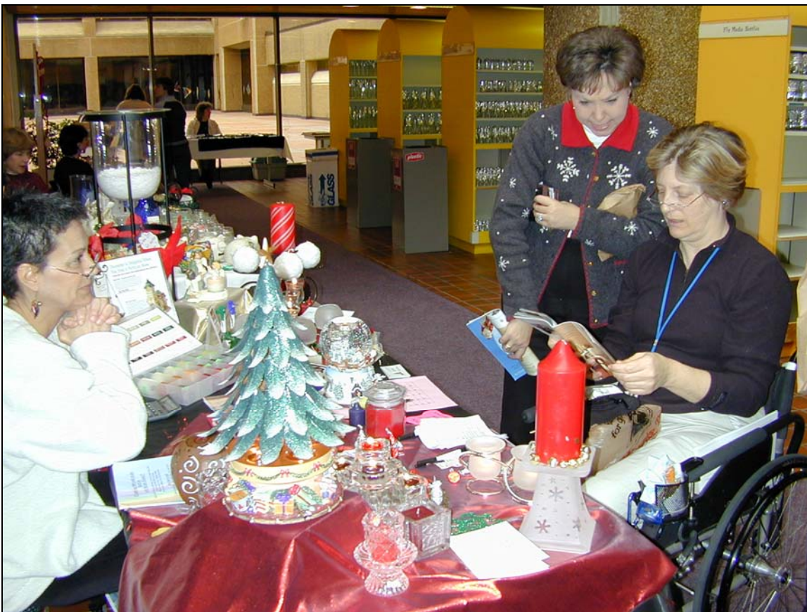
The annual craft fair features home-baked and hand-crafted goodies. It spans the mall areas of the C, D, E and F buildings. The number of vendors has more than doubled since the first craft fair in 1992. 2003 file