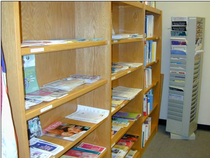
The NIEHS Work/Life Center is located near the library entrance in the basement of the A building.

Material can be checked out at the library desk.