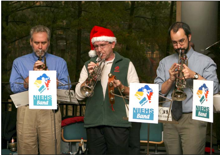
The NIEHS brass band played Christmas songs while employees sang along.