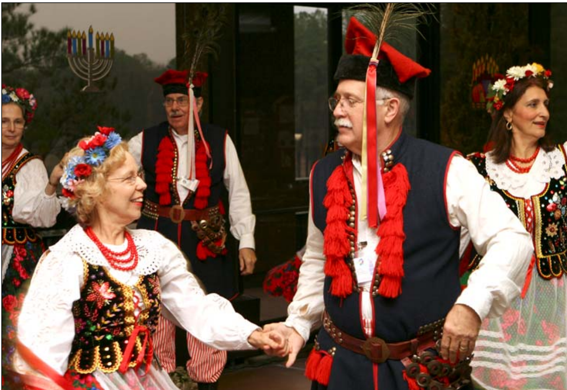
A Polish dance troupe performed a lively routine for the audience.