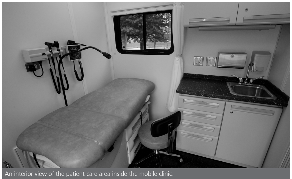
An interior view of the patient care area inside the mobile clinic.

For more information about the VRC's work or to participate in a vaccine trial, go to http://vrc.nih.gov/ or contact vaccines@nih.gov or 1-866-833-LIFE. ■