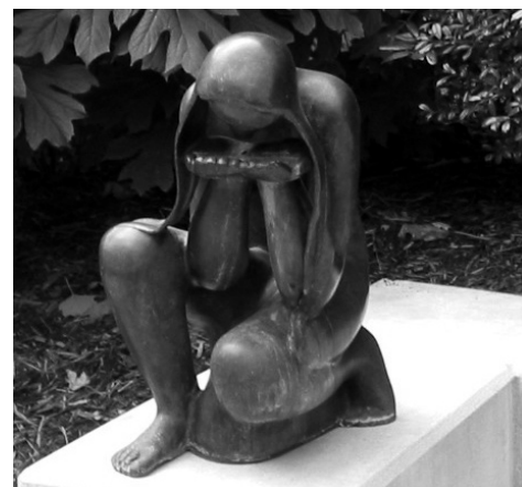
The Healing Waters fountain is now located in the west courtyard.

Azriel's second work on the NIH campus is on the grounds of the Children's Inn. ■