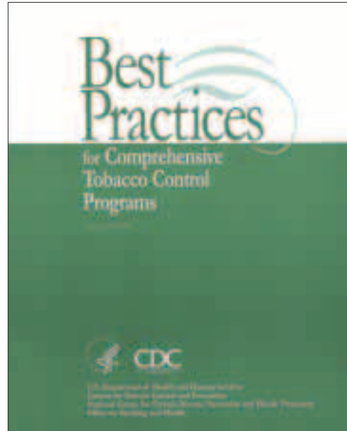
1999 CDC report on effective tobacco control programs

Availability of funds from the Master Settlement Agreement and the ensuing state-level campaigns focused tobacco control advocates on the problems of acquiring these funds for tobacco prevention and control programs. Interest in policy issues, such as increased excise taxes or clean indoor air, almost uniformly was displaced by more immediate concerns about developing a workable plan