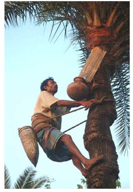
Collecting the sap of date palms to sell as a sweet drink in Bangladesh may be a risk factor for bat-to-human transmission of the Nipah virus.

Environmental determinants favorable for the presence and transmission of vibrios, bacteria typically found in saltwater and important human