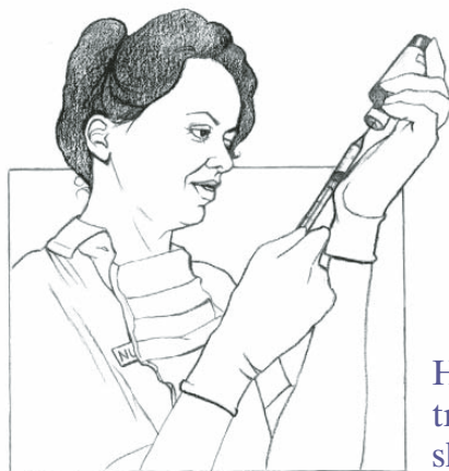
Hepatitis B is treated through shots of medicine.