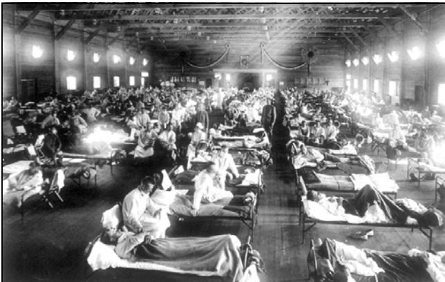
The 1918 Spanish Flu Epidemic killed more than 50 million people worldwide.

The study team, including Fogarty scientist Cécile Viboud, report only .02 percent of Copenhagen's population died during the summer wave, as compared with .27 percent during the fall wave. Similar patterns were observed in three other Scandinavian cities and likely represent a wider European or even global experience, the study suggests.