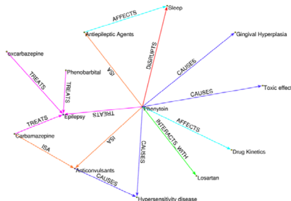
Figure 3. Summarization results for Phenytoin.

illustrates the results of summarizing 508 Medline citations retrieved with the query “phenytoin.”