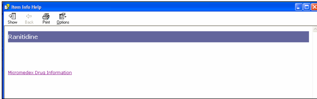
Figure 1: Display of Item Info window for Ranitidine with the new link to Micromedex after selecting the "Item Info" button.