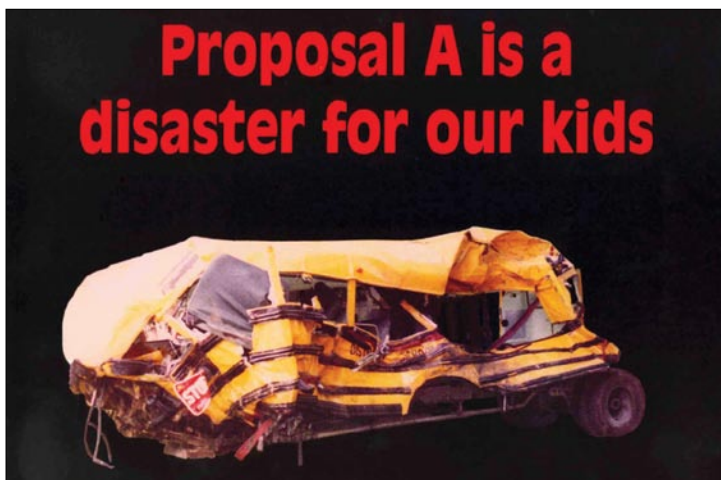
Direct mail brochure from the Michigan Citizens for Fair Taxes campaign (here and next page)