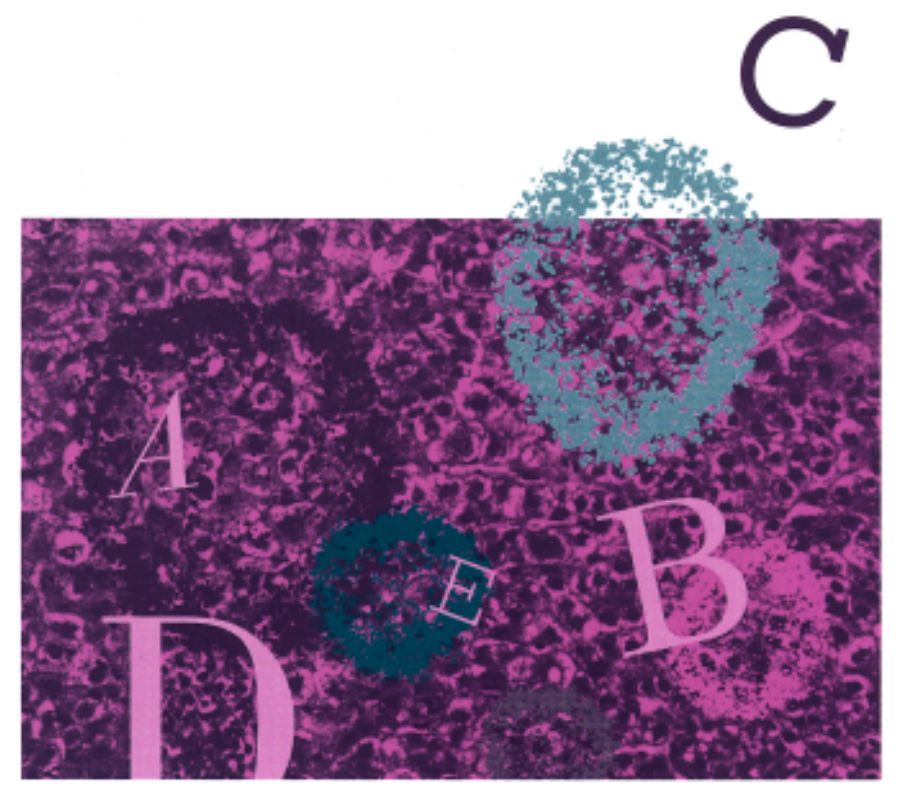
Management of Hepatitis C

NATIONAL INSTITUTES OF HEALTH Office of the Director