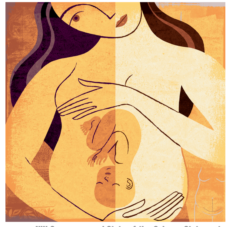
NIH Consensus and State-of-the-Science Statements