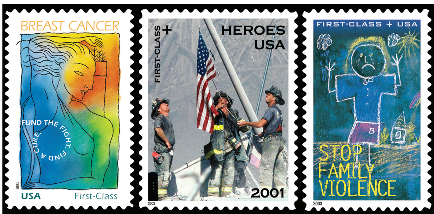
Figure 2: Breast Cancer Research, Heroes of 2001, and Stop Family Violence Stamps

Violence stamps. Semipostals are stamps sold at a premium above the First-Class postage rate; the net premium amount supports a designated cause. The semipostal proceeds are transferred from the Service to the designated federal agencies. The three semipostals were authorized through separate congressional acts relating to each stamp. The Stamp Out Breast Cancer Act required that the Service issue the Breast Cancer Research stamp. The Heroes of 2001 and Stop Family Violence stamps were mandated by Congress in the 9/11 Heroes Stamp Act of 2001 and the Stamp Out Domestic Violence Act of 2001, respectively. 6 Figure 2 illustrates the three semipostals.