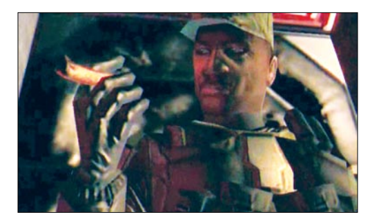
Xbox game "Halo 2" character Sergeant Major Avery Johnson with cigar

In the first level, as soon as you get off the lift do not go on the train. Instead, look to your right to find a trash can. Go over to it, crouch, and look in between the can and the wall. There should be a Johnson Cigar burning away. Additionally, go to the armory. As you are coming up the stairs, you will hear the man shooting his shotgun and talking. Kill the Elites and go through the door. Jump over the turret and look to the right. Jump on the lights sticking out of the wall, then jump over the rail. Get on one of the beams