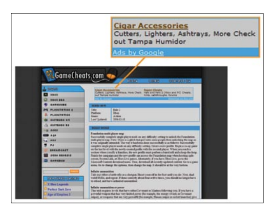
Cigar accessories advertised to "Halo 2" players

performance of music, commercial film or video, or video game " (emphasis added). 80(p.18) Cigar manufacturers, however, are not parties to the MSA between the major cigarette firms and 46 state attorneys general.