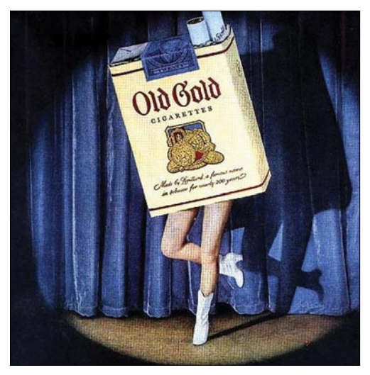
Dancing cigarette advertisement from 1950s quiz show

Over the past 50 years, the representation of cigarettes on television and radio has changed radically. Fifty years ago, cigarettes were associated with glamour, good times, and fun. Their images were accompanied