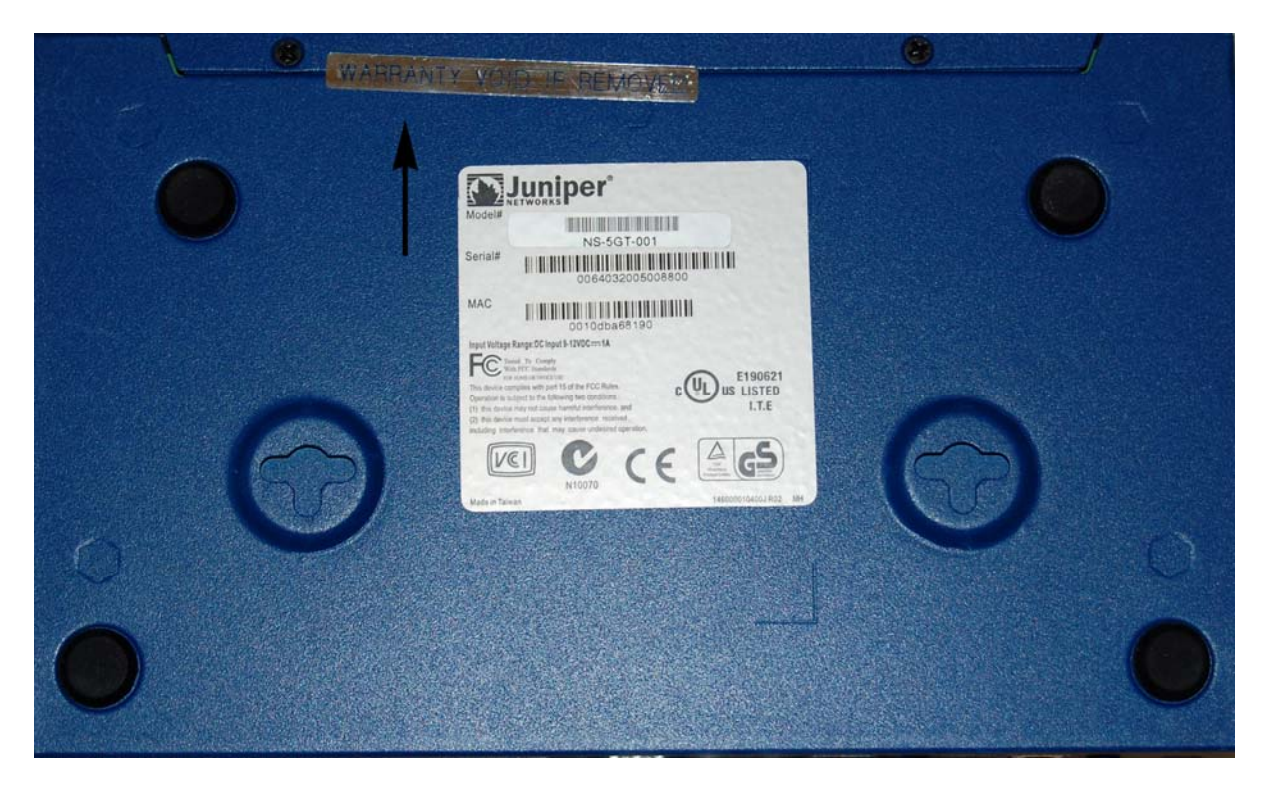
Figure 2: Underside of the NS-5GT, with location of tamper evident seal