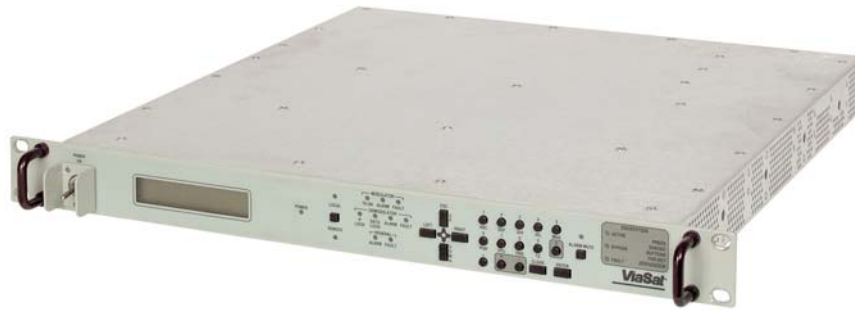
Figure 1 – Image of the Cryptographic Module

The Enhanced Bandwidth Efficient Modem (EBEM) Cryptographic Module is a multi-chip standalone module as defined in the Federal Information Processing Standards (FIPS) 140-2. The module has two configurations: tactical (Hardware P/N 1010163, Version 1; Firmware Version 01.03.05) and strategic (HW P/N 1010162, Version 1; FW Version 01.03.05). The cryptographic boundary is realized as the external surface of the EBEM enclosure. The EBEM is a high-speed, high performance, flexible and compatible Single Channel Per Carrier (SCPC) modem. The EBEM incorporates the latest technology in advanced modulation and coding, while providing backwards interoperability with the majority of existing SCPC modems. It offers optimal power and bandwidth efficiency with 16-ary modulation and turbo-coding. It supports a large range of user data rates, from 64 kbps up to 155 Mbps.