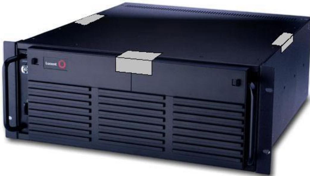
Figure 2 – Tamper evidence label placement on front panel/top

The placement of the labels should be consistent with the instructions and the images above. The tamper evidence seals have a special adhesive backing to adhere to the module's painted surface. Removing the power panel, network interface panel, bottom cover or top cover will damage the tamper evidence seals. Tamper evidence labels can be inspected for signs of tampering, which include the following: curled corners, bubbling, and rips.