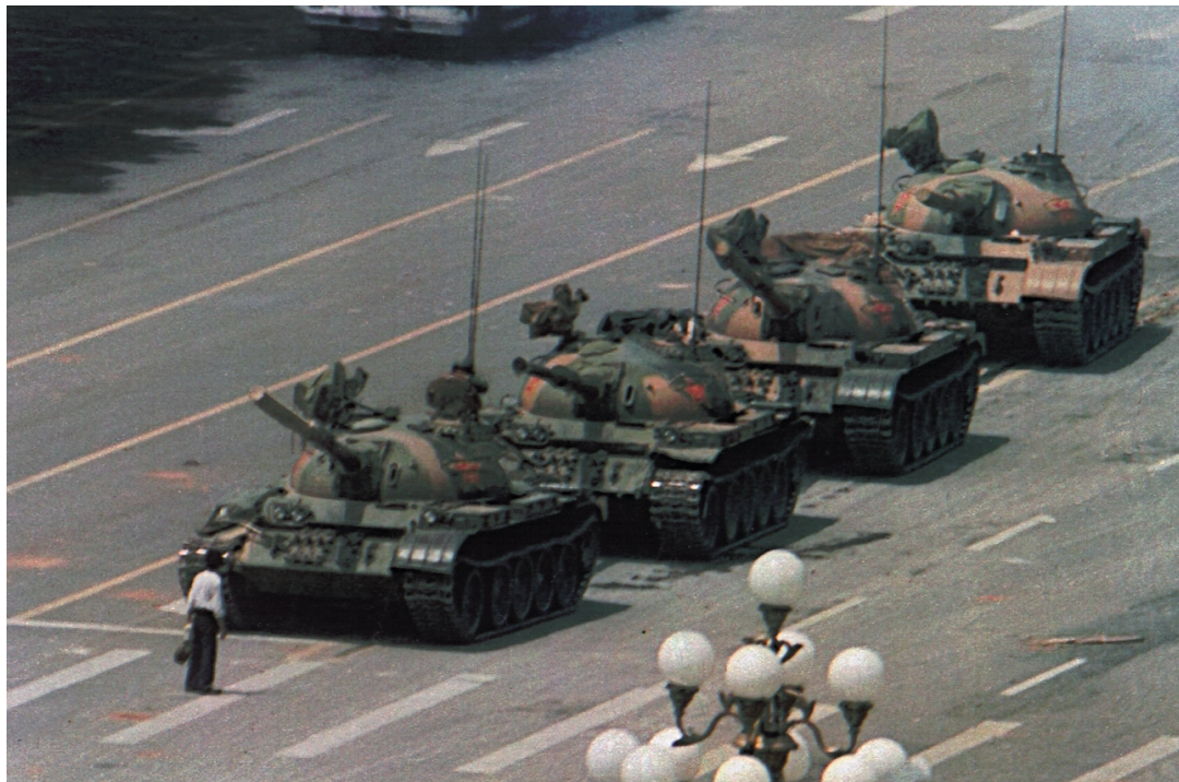
Prior to the June 4, 1989 massacre at Tiananmen Square in Beijing, the United States and other COCOM members differentiated between the People’s Republic of China and the Soviet Union — and gave the PRC access to higher levels of technology.