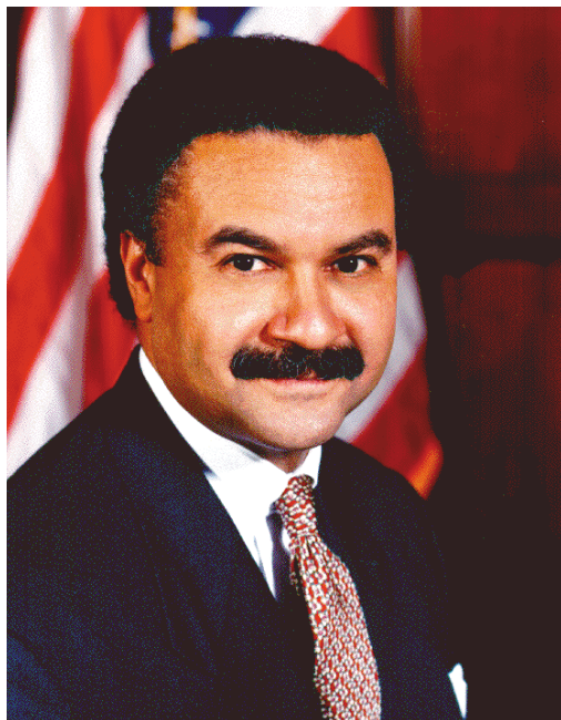
Secretary of Commerce Ronald H. Brown issued the first Trade Promotion Coordinating Committee report in the fall of 1993. The report cited “numerous consultations with exporters,” but did not indicate whether the national security implications of the proposed liberalization of export controls had been analyzed.

The 1992 Act stated that the Trade Promotion Coordinating Committee was to “coordinate export promotion and export financing activities of the U.S. Government.” The Act did not state expressly that the Committee was a mechanism to conduct a review of the Commerce Department’s export control program under the Export Administration Act, or a review of the State Department’s export control program under the Arms Export Control Act.