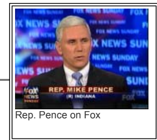
Rep. Pence on Fox

"The American people love a fair fight, especially where the issues of the day are debated. In a free market, fairness should be determined based upon equal opportunity, not equal results. As some voices are calling for Congress to enforce their idea of 'fairness' upon the American people, it would be good for us to proceed with caution whenever some would achieve their 'fairness' by limiting the freedom of others.