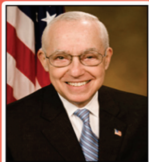
Attorney General Michael B. Mukasey Guest Speaker & Awards presenter at the May 16, 2008 FEB Awards