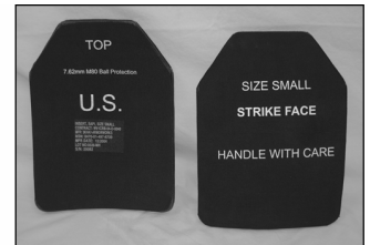
Ceramic body armor plates