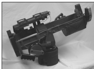
Guided missile mount