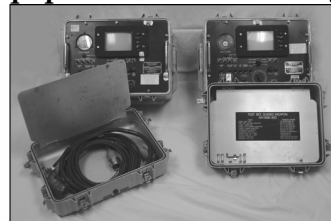
Radar test sets