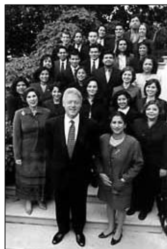
President Clinton with Latino appointees during Hispanic Heritage Month in 1998.