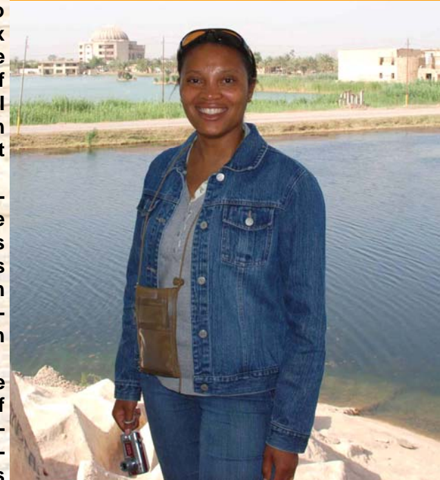
At Baghdad's "Flintstone Village," built for Saddam's grandchildren, Sandy looks over the nearby lake.

For more information on challenging GRC jobs in Iraq visit: http://cpolwapp.belvoir.army.mil/coe-gwot/