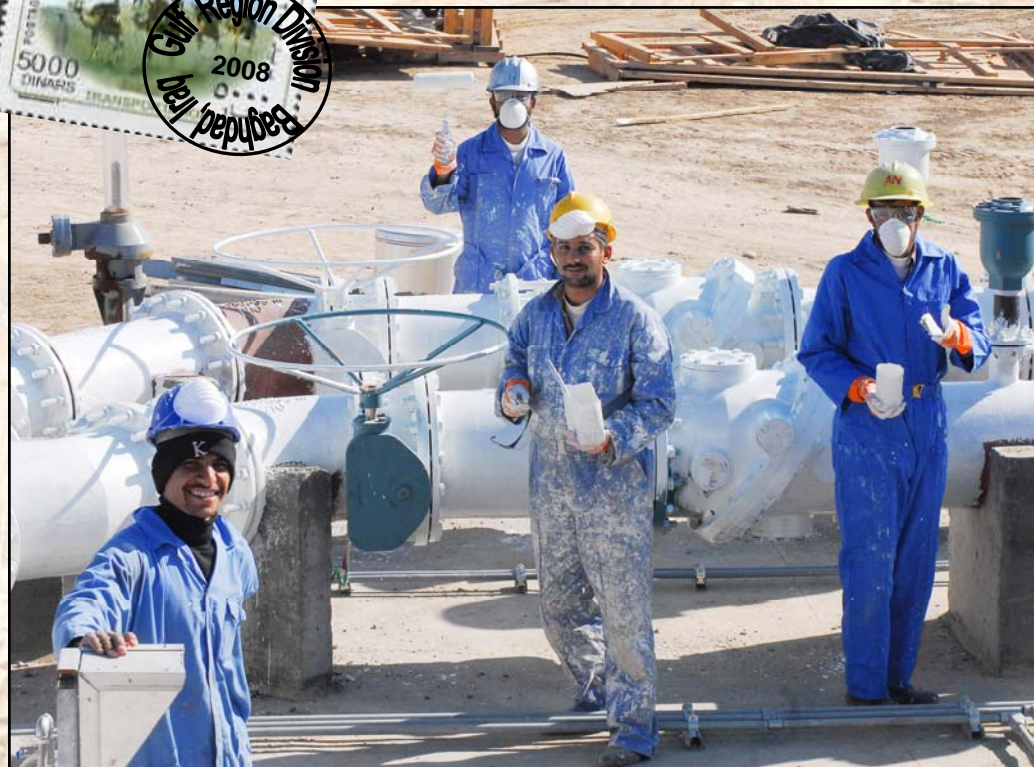
Iraqis are taking the lead in helping rebuild their nation, with most of the work now being done by Iraqi firms hiring local Iraqi laborers.