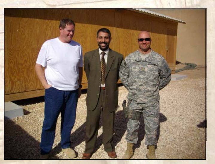
Fallujah's Minister of Electricity

Progress at Fallujah's first ever sewer system project