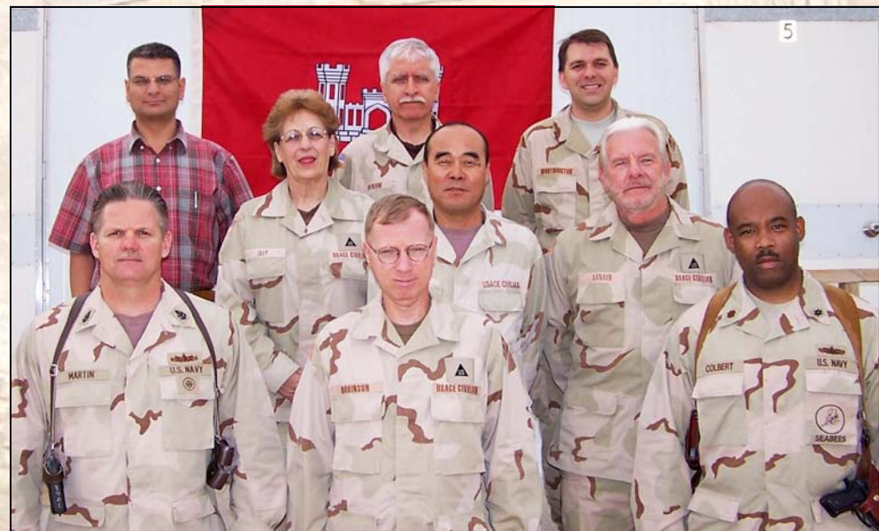
Al Asad USACE staff.