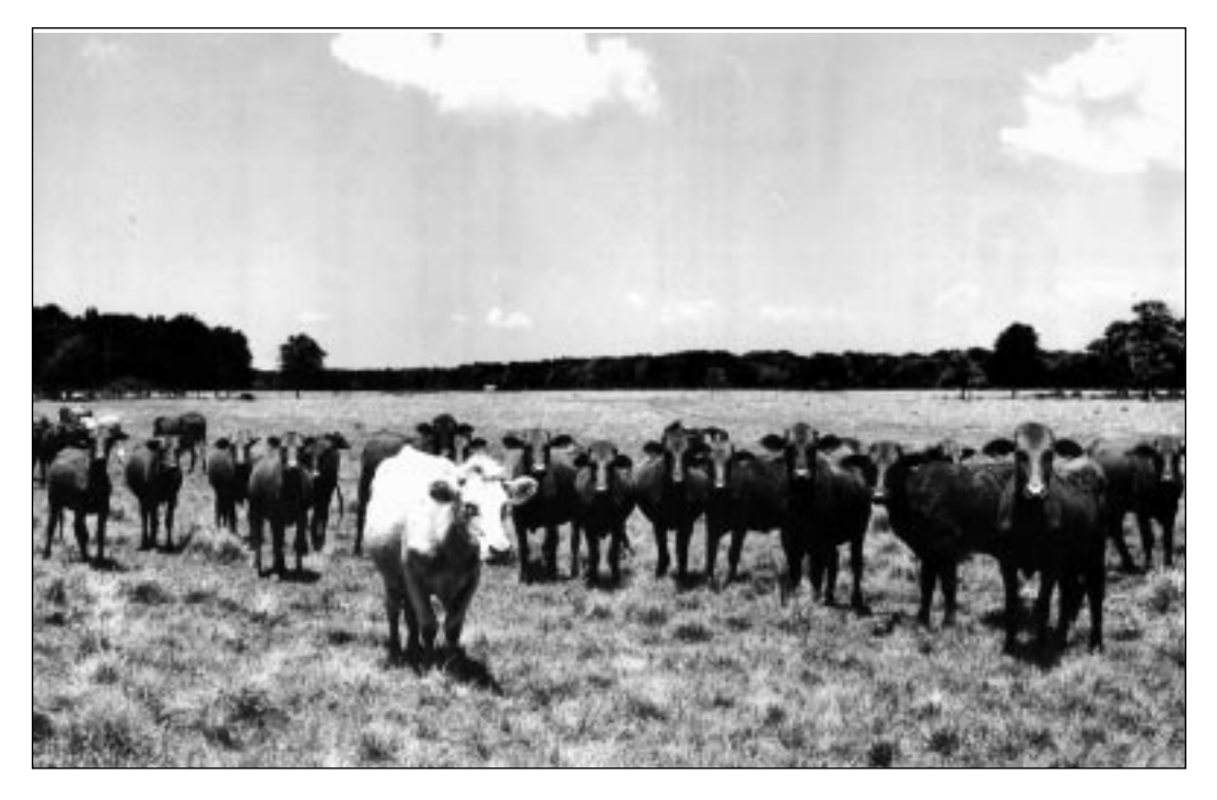
Texas cattle grazed the 1000-acre land parcel outside Houston at the time its selection as site of the Manned Spacecraft Center was announced. Soon they were herded out to make room for spacecraft, astronauts, and engineers.

laboratory should be located in Houston, Texas, in close association with Rice University and the other educational institutions there and in that region."<sup>17</sup> After advance notifications of the award were made by the Executive Office and from NASA, the public announcement of the location followed on September 19, 1961.