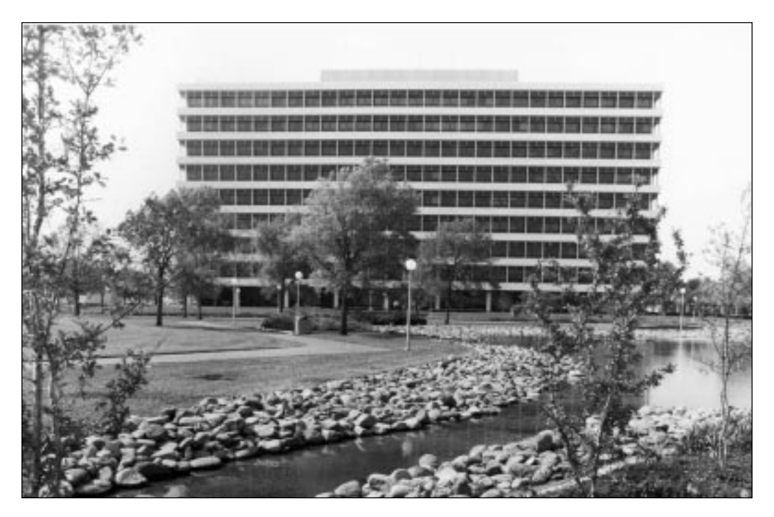
Building 1, the Administration Building.

Ed Campagna, for example, listed as among the outstanding construction achievements the overall design concept of using prefabricated exterior building panels, which has since become common practice, but at the time was a pioneering concept. It was a major element in bringing construction to the required speed and keeping costs contained. The center employed a cost-efficient continuous-loop utility services system. A data acquisition center monitored heating and air pumps, fans, valves and electrical systems providing efficient maintenance and operation. Interior office modules, also at the time a novel feature, lowered costs and made for more efficient utilization of interior spaces. On the other hand, the original administrative building design proved nonfunctional, far exceeded costs, and had to be redrafted; the original design and specifications for the environmental chambers totally failed; and utility relays and stations had to be added later to accommodate expansion. Overall, Gilruth and most of the MSC staff believed that the physical facilities filled the requirements of the program and were built with taxpayer cost consciousness in mind. Gilruth attributed much of the efficiency of the plant to the design and planning work of Max Faget, Aleck Bond, and Dick Johnston.<sup>44</sup>