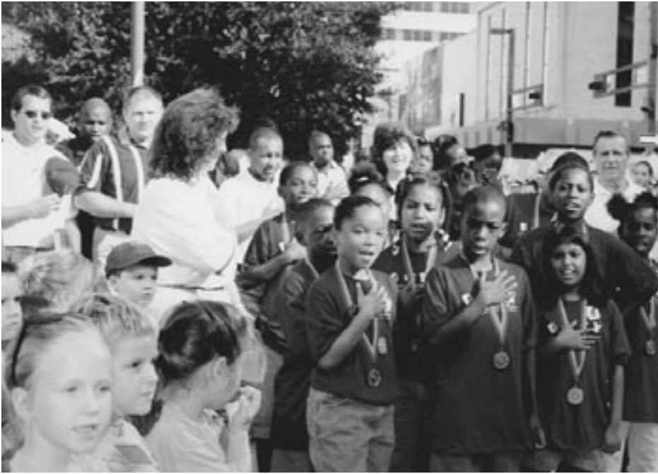
DEFY youth from the Middle District of Florida lead the Tampa community in the Student Pledge Against Gun Violence at a crime prevention rally held in downtown Tampa outside the U.S. Attorney's Office.

plan. Although USAO staff felt they had been conscientious about incorporating education into their holistic outreach plans in the past, the summits have served as great tools for expanding and directing the Middle District's gun violence reduction strategy. Based on the recommendations of these summits, PSN/HALT the Violence! is conducting community forums in Polk County/Lakeland/Haines City and Hillsborough County/Tampa through a pilot program with funding from the Office of Community Oriented Policing Services and a partnership with the Fox Valley Technical Institute.