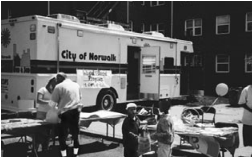
On most days, Norwalk's Weed and Seed Mobile Community Outreach Police Substation (MCOPS) is used to provide outreach to the Norwalk Weed and Seed community. On September 11, however, it traveled to ground zero to support relief efforts at the World Trade Center.

officers to head to New York to assist NYPD, and Chief Harry Rilling deployed the department's Weed and Seed Mobile Community Outreach Police Station (MCOPS) vehicle. Norwalk Police Department personnel quickly loaded the vehicle for the 2-hour drive to New York City; officers had collected every 5-gallon water container they could find, as well as flares, flashlights, medical aid kits, and other supplies. The MCOPS vehicle was assigned to a checkpoint on the main emergency route, at Westside Highway and 14th Street. Once near "ground zero," officers loaded more supplies, food, tools, and clothing. While some officers manned the checkpoint and secured the area, other officers distributed supplies. The MCOPS provided one of the few locations with working lights, generators, and air conditioning. Rescue workers and police officers used the MCOPS van to rest, regroup, and prepare to deploy back into ground zero. The MCOPS vehicle has always been a place for Norwalk citizens to get assistance and support. The Norwalk Police Department was very proud to lend the MCOPS vehicle in support of the heroes of September 11.