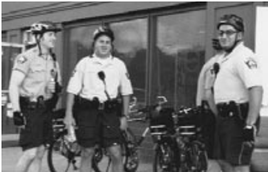
Officers from the Minneapolis Police Department's 3d Precinct prepare for the saturation detail of the Phillips Neighborhood to let residents know they care about the community's well-being.

On May 11, 2001, the Minneapolis Police Department's 3d Precinct conducted a saturation detail in the Phillips Neighborhood, a neighborhood in which more than half of the residents live in poverty. Ongoing problems exist with narcotics trafficking, gang violence, prostitution, and other related crimes and calls for police service are higher than any other neighborhood in Minneapolis. In an effort to connect with the community, more than 60