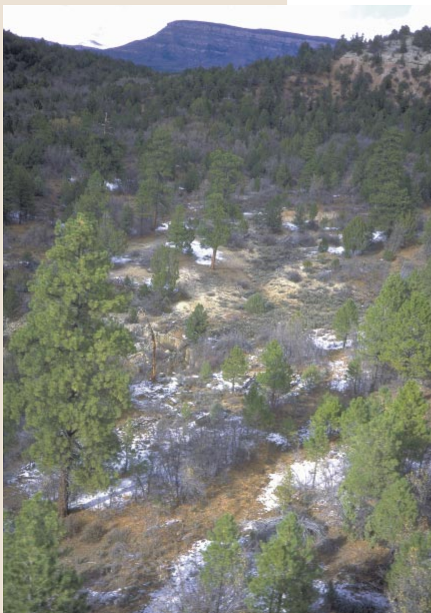
ORDERVILLE CANYON—Excellent screening is provided by ponderosa pine, piñon, oak, and juniper, enhancing outstanding solitude opportunities in Unit 1 and the contiguous WSAs.

The six units are ecological extensions of the Orderville Canyon WSA and the North Fork WSA, where special features have been identified. Four Category 2 candidate plant species may occur: Asplenium andrewsii , Erigeron sionis , Heterotheca ionensis , and Sphaeromeria ruthiae . Raptors that may inhabit the area include golden eagles, peregrine falcons, and red-tailed and Cooper's hawks. Big game animals include mule deer, elk, and cougar.