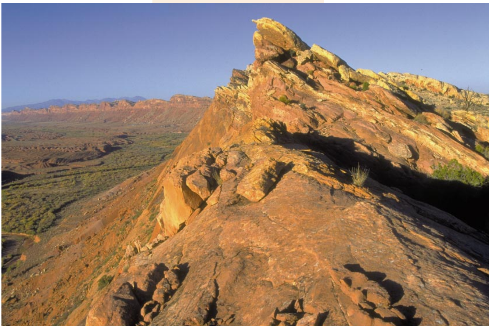
COMB RIDGE—Challenging hikes and some of the most impressive views in southern Utah reward the visitor to Comb Ridge.

The scenic quality of this unit is excellent. Even the most casual visitor cannot help being impressed by the massive up-warp of Navajo sandstone forming the spine of Comb Ridge. Several cliff dwellings and rock art panels highlight the significant archaeological resources found here.