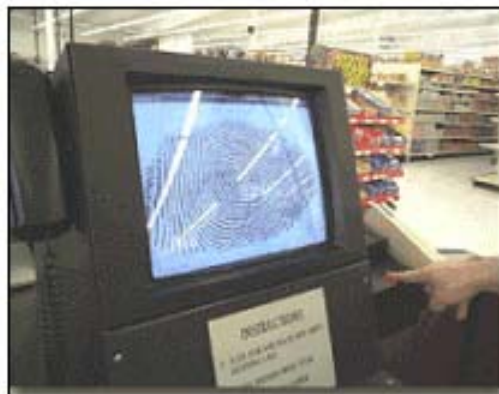
A sales clerk checks a customer's thumbprint.

Researchers have shown that adding simple security procedures can significantly reduce check and card fraud. In one U.S. study in a retail store, 32 a system that used picture IDs of customers who paid with credit cards reduced fraud by over 80 percent. Furthermore, retail stores (especially supermarkets) have found that customer databases that issue customers ID cards can also be used as an effective marketing tool to advertise special sales and promotions. A study in Norway 33 showed that legislation requiring people to show two forms of ID when cashing checks reduced check fraud by over 80 percent.†