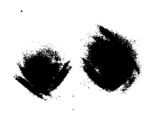
Figure IV-3. Immunodittusion in agar of patient's serum (center wells) against pigeon antigens (peripheral wells) resulting in precipitin reaction.