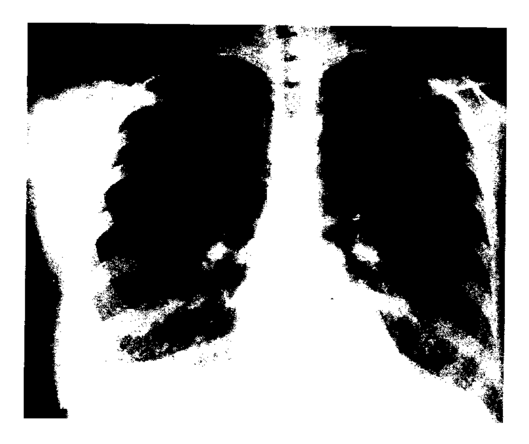
Figure IV-4. Chest x-ray of 35-year-old pigeon breeder with recurrent acute episodes of hypersensitivity pneumonitis. Nodular interstitial infiltrates are prominent at the bases.

There is generalized elevation of immunoglobulin levels, except for IgE. Rheumatoid factor tests are often positive during periods of illness, but become negative after prolonged avoidance.