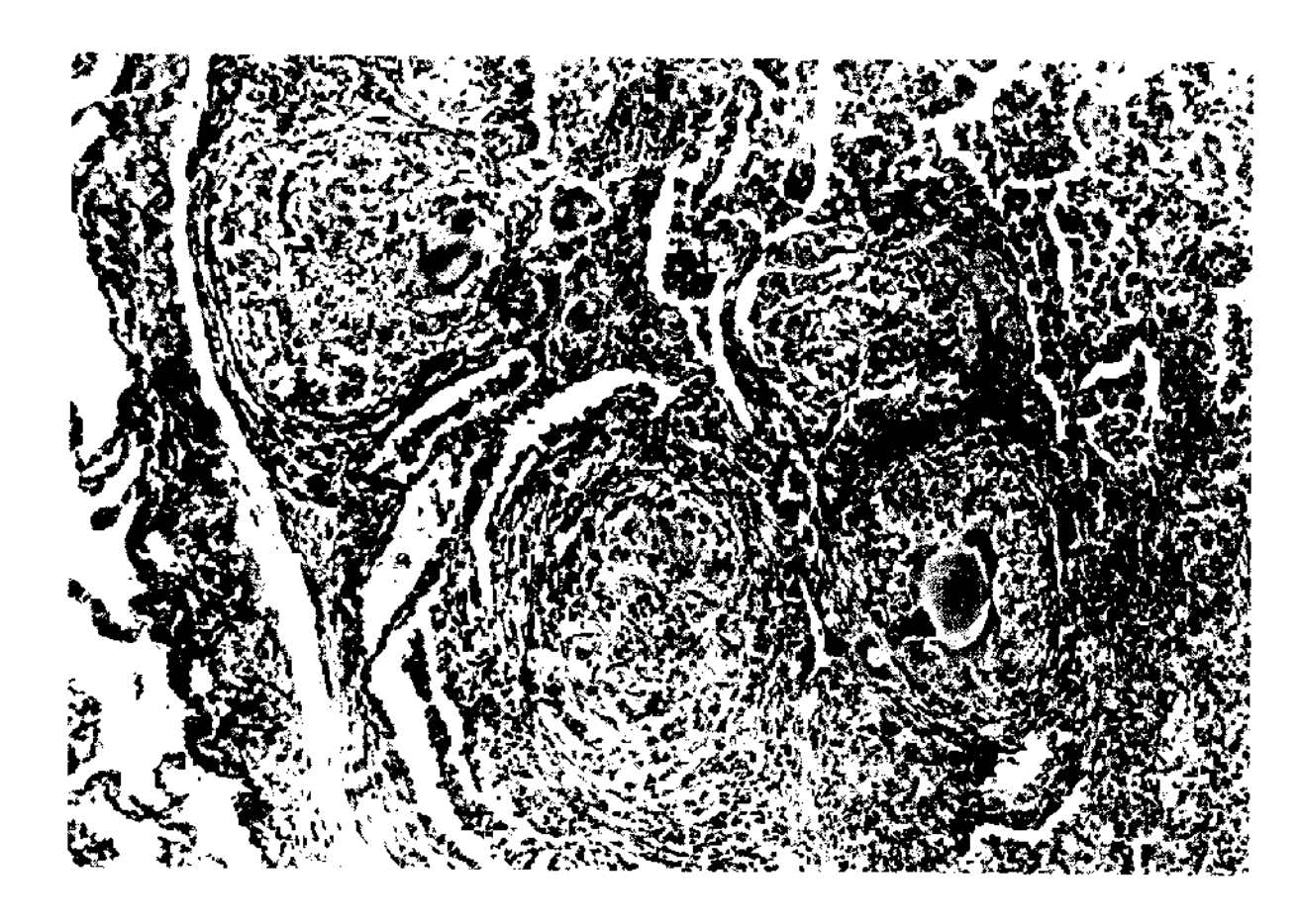
Figure IV-1. Photomicrograph of lung biopsy from 23-year-old woman with hypersensitivity pneumonitis due to contamination of the home humidification system. Sarcoid like granuloma formation and diffuse lymphocytic infiltration is evident.

by fibrosis and alveolar cell hyperplasia. Intraalveolar organizing Masson bodies are seen. Small muscular arteries are thickened and selerotic. In honeycomb lung, a similar residual chronic inflammatory process may be present in the interstitial and intra alveolar spaces, and the airspaces are enlarged and cyst-like—reaching a dimension of 0.5 cm to 1.0 cm. The walls of these spaces are fibrotic; contain elements of hypertrophied smooth muscle, plasmacytes, and lymphocytes; and are frequently lined by hypertrophied bronchial epithelial cells. The muscular arteries and arterioles are markedly thickened (59).