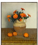
19 Félix Vallotton Swiss, 1865 - 1925 Marigolds and Tangerines , 1924 oil on canvas 65.3 x 54.2 cm (25 3/4 x 21 3/8 in.) Chester Dale Collection 1963.10.78