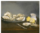
07 Edouard Manet French, 1832 - 1883 Oysters , 1862 oil on canvas 39.2 x 46.8 cm (15 7/16 x 18 3/4 in.) Gift of the Adele R. Levy Fund, Inc. 1962.3.1