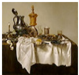
06 Willem Claesz Heda Dutch, 1593/1594 - 1680 Banquet Piece with Mince Pie , 1635 oil on canvas 106.7 x 111.1 cm (42 x 43 3/4 in.) Patrons' Permanent Fund 1991.87.1