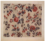
39 Sylvia De Zon American, active c. 1935 Chintz , c. 1939 watercolor and graphite on paper 41.8 x 50.3 cm (16 7/16 x 19 13/16 in.) Index of American Design