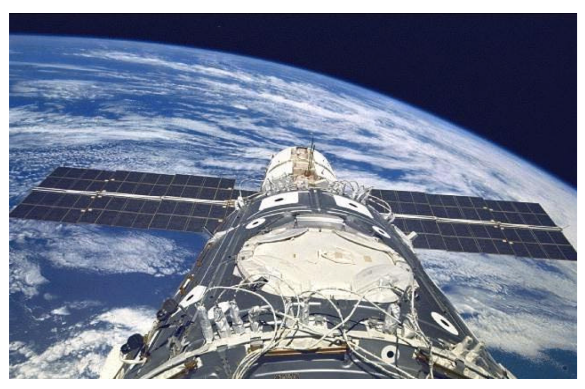
The International Space Station Unity (foreground) and Zarya modules as seen from the Space Shuttle Endeavour as the two modules were attached in orbit in December 1998.

Assembling the station is an unprecedented task, turning Earth orbit into an ever-changing construction site. More than 100 elements will be joined over the course of approximately 45 assembly flights using the Space Shuttle and two types of Russian rockets. An international cast of astronauts and cosmonauts will do much of the work by hand, performing more space walks in just five years than have been conducted throughout the history of space flight.