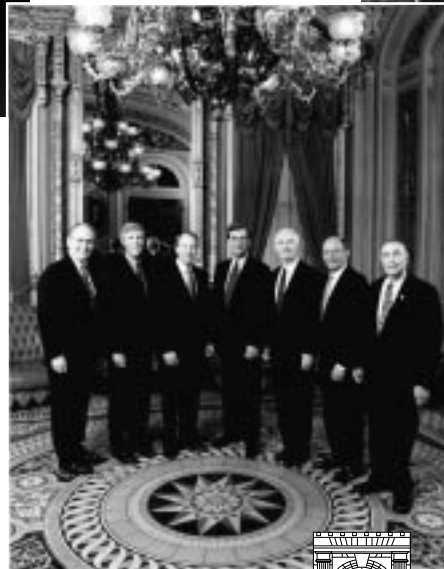
New Senate leadership lineup following Senator Dole's retirement.