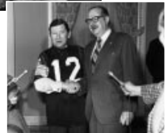
Senators Tower (R-TX) and Scott (R-PA).