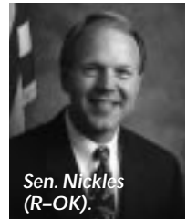
Sen. Nickles (R-OK).