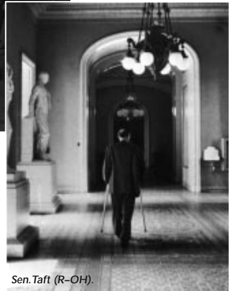
Sen. Taft (R-OH).