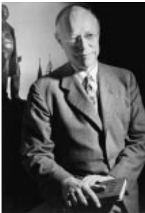
Sen. Taft (R-OH).

Senate Republicans: 42 (loss of 9, loss of majority); Democrats: 54 Republican Minority Leader: Kenneth S. Wherry Republican Policy Committee Chairman: Robert Taft