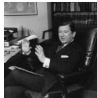
Sen. Tower (R-TX).