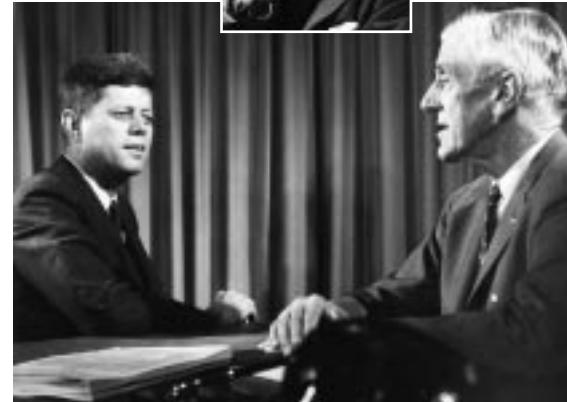
Senators Kennedy (D-MA), and Saltonstall (R-MA).

Senate Republicans: 35 (loss of 12); Democrats: 65 Republican Minority Leader: Everett Dirksen Republican Policy Committee Chairman: Styles Bridges Everett Dirksen holds regular press conferences following the Policy Committee lunches John Kennedy elected president, 1960