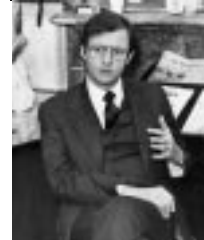
Sen. Armstrong (R-CO).