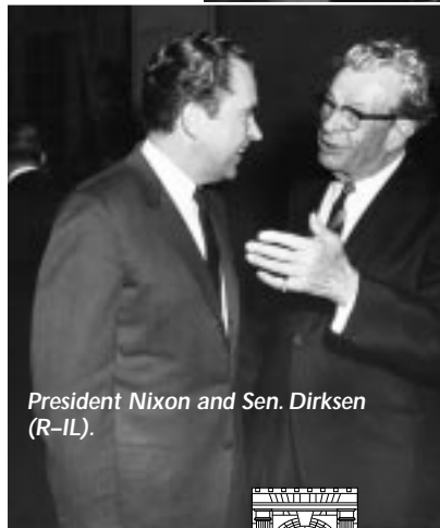
President Nixon and Sen. Dirksen (R-IL).