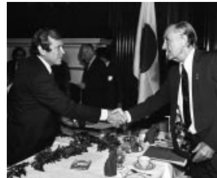
Sen. Baker (R-TN) and Ambassador to Japan Mansfield.