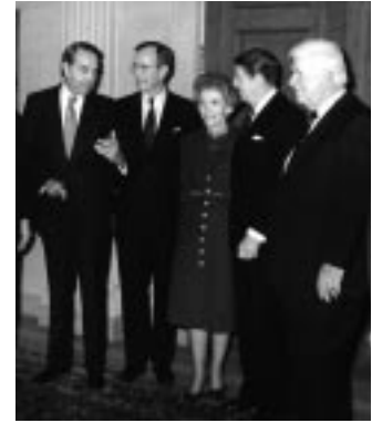
Sen. Dole (R-KS), Vice President Bush, President and Mrs. Reagan, and House Speaker O'Neill.