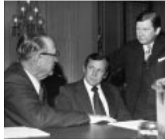
Senators Young (R-ND), Baker (R-TN), and Tower (R-TX).

Senate Republicans: 39 (loss of 4); Democrats 61 Republican Minority Leader: Hugh Scott Republican Policy Committee Chairman: John Tower Jimmy Carter elected president, 1976