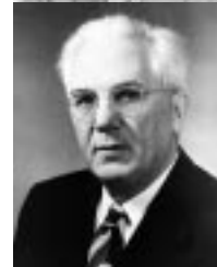
Sen. Ferguson (R-MI).