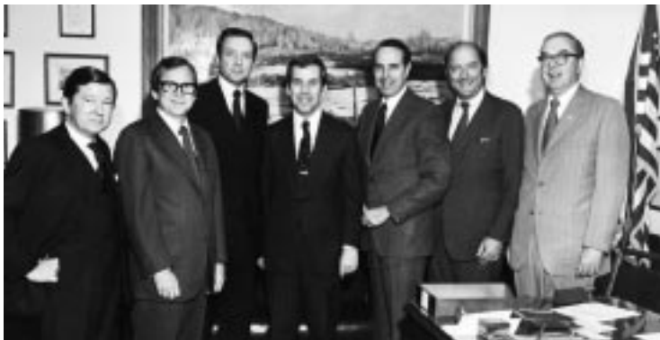
Senators Tower (R-TX), Baker (R-TN), Hatch (R-UT), Lugar (R-IN), Dole (R-KS), Wallop (R-WY), and Helms (R-NC).