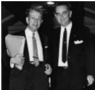
Senators Dirksen (R-IL) and Johnson (D-TX).