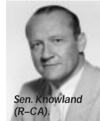
Sen. Knowland (R-CA).

Senate Republicans: 47 (loss of 1, loss of majority); Democrats: 49 Republican Minority Leader: William Knowland Republican Policy Committee Chairman: Styles Bridges Weekly Policy Committee lunches begin (January 17, 1956)