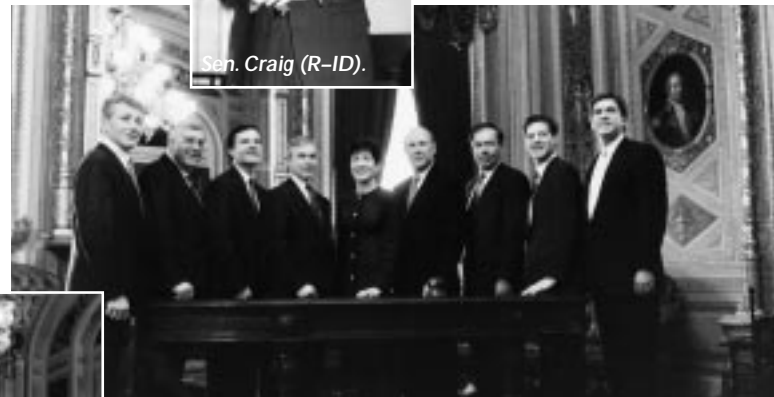
Republican Class of 1996, Senators Hagel (R-NE), Enzi (R-WY), Hutchinson (R-AR), Sessions (R-AL), Collins (R-ME), Roberts (R-KS), Allard (R-CO), Brownback (R-KS), and Smith (R-OR).