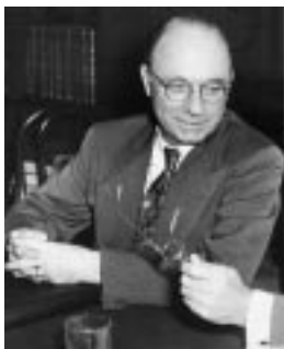
Sen. Hickenlooper (R-IA).