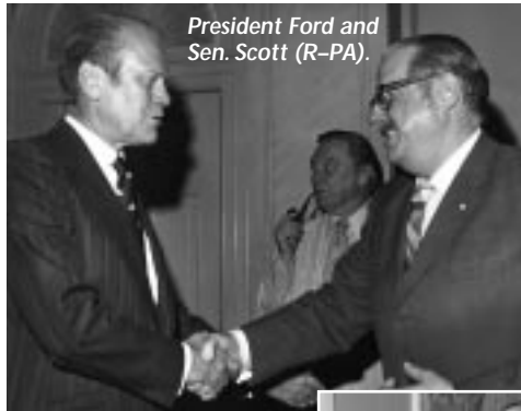
President Ford and Sen. Scott (R-PA).