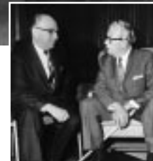
Senators Dirksen (R-IL) and Hickenlooper (R-IA).