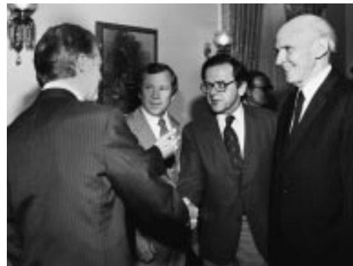
President Carter with Senators Baker (R-TN), Stevens (R-AK), and Cranston (D-CA).