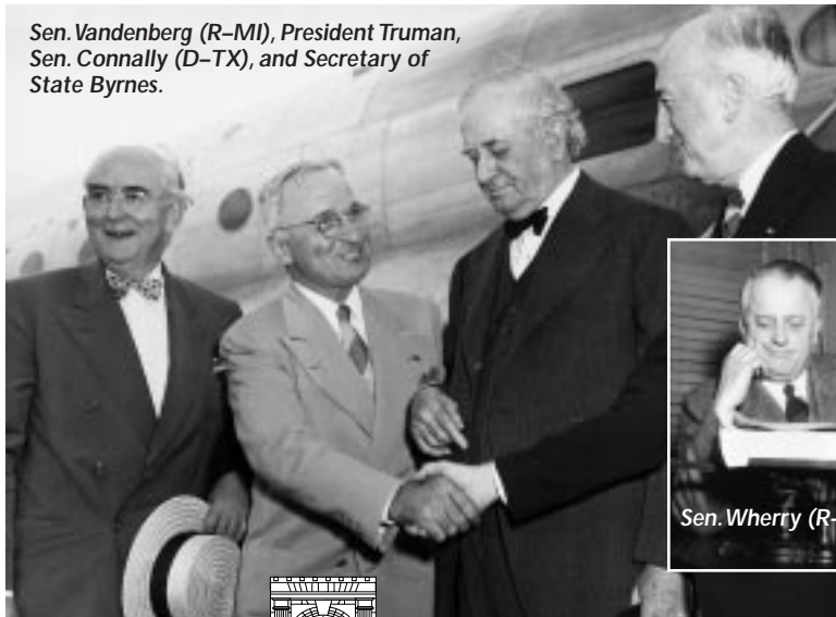
Sen. Vandenberg (R-MI), President Truman, Sen. Connally (D-TX), and Secretary of State Byrnes.