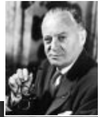
Sen. Bridges (R-NH).

Senate Republicans: 47; Democrats: 49 Republican Minority Leader: William Knowland Republican Policy Committee Chairman: Styles Bridges