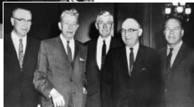
Senators Young (R-ND), Dirksen (R-IL), Saltonstall (R-MA), Hickenlooper (R-IA), and Kuchel (R-CA).