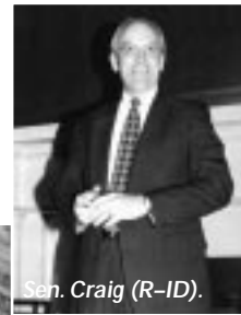
Sen. Craig (R-ID).

Senate Republicans: 55 (gain of 1); Democrats 45 Republican Majority Leader: Trent Lott Republican Policy Committee Chairman: Larry Craig