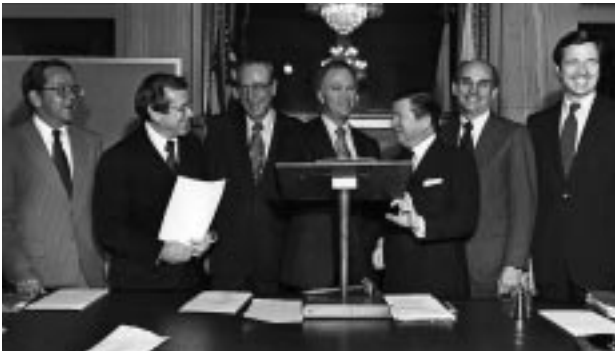
Senate Republican Leaders, Senators Stevens (R-AK), Baker (R-TN), Young (R-ND), Packwood (R-OR), Tower (R-TX), Garn (R-UT), and Heinz (R-PA).