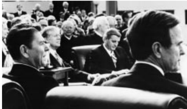
Presidents Reagan and Carter with Vice Presidents Bush and Mondale.

Republicans win majority in the Senate; Democrats retain majority in House, 1980