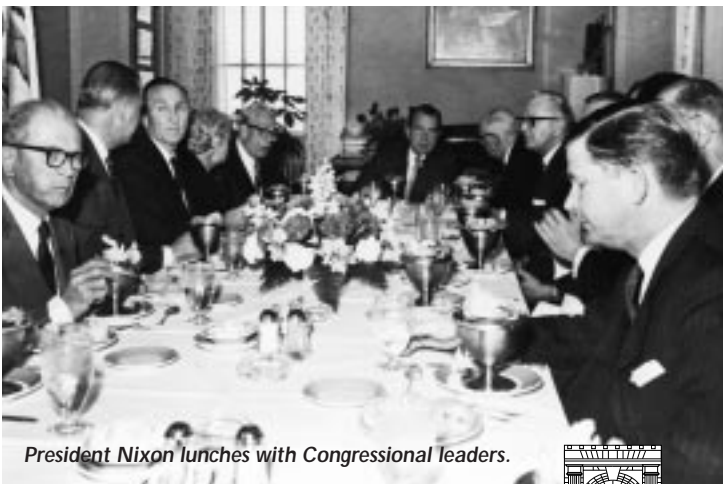
President Nixon lunches with Congressional leaders.