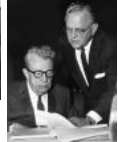
Senators Dirksen (R-IL) and Allott (R-CO).