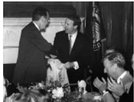
President Bush accepts a symbolic gift from Policy Committee Chairman Nickles.