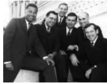
Republican Class of 1966, Senators Brooke (R-MA), Griffin (R-MI), Percy (R-IL), Hatfield (R-OR), Hansen (R-WY), Baker (R-TN).

Senate Republicans: 36 (gain of 4); Democrats: 64 Republican Minority Leader: Everett Dirksen Republican Policy Committee Chairman: Bourke Hickenlooper Richard Nixon elected president, 1968