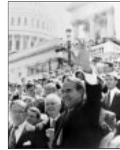
Sen. Dole (R-KS) on his last day as a Senator.

Senate Republicans: 54 (gain of 9); Democrats: 46 Republican Majority Leader: Robert Dole Republican Policy Committee Chairman: Don Nickles Senate and House Republican Policy Committees hold joint hearings and issue joint publications Robert Dole resigns as Majority Leader (June 11, 1996) to become Republican presidential candidate Trent Lott elected Majority Leader Don Nickles elected Assistant Majority Leader Larry Craig elected chairman of the Republican Policy Committee Republicans retain the majority in the Senate and House, 1996