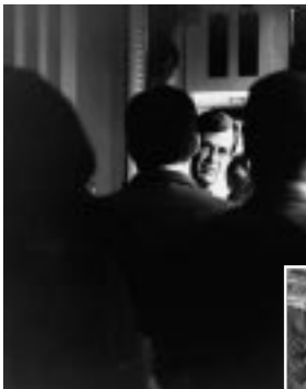
Sen. Lott (R-MS).