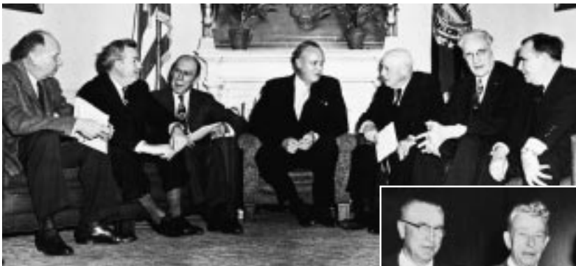
Secretary of Senate Trice, Sen. Sparkman (D-AL), Sen. Green (D-RI), Sen. Bridges (R-NH), House Speaker Rayburn (D-TX), Rep. McCormack (D-MA), and Rep. Martin (R-MA).

Senate Republicans: 36 (gain of 1); Democrats: 64 Republican Minority Leader: Everett Dirksen Republican Policy Committee Chairman: Styles Bridges Styles Bridges dies (November 26, 1961) Bourke Hickenlooper elected chairman of the Republican Policy Committee