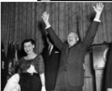
President and Mrs. Eisenhower.