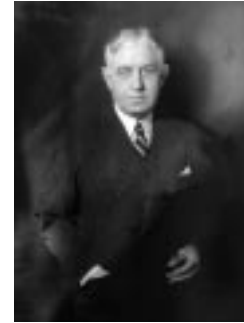
Sen. White (R-ME).

Senate Republicans: 38; Democrats: 57 Republican Minority Leader: Wallace H. White, Jr. Republican Policy Committee Chairman: Robert Taft Legislative Reorganization Act proposes creating Policy Committees; House objects Senate Policy Committees established in Legislative Appropriations Act Republicans win majorities in both the Senate and House, 1946 Senate Policy Committee holds first meeting (December 31, 1946)