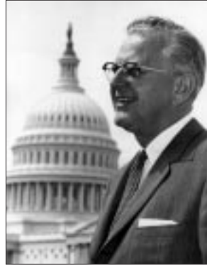
Sen. Allott (R-CO).

Senate Republicans: 43 (loss of 2); Democrats: 57 Republican Minority Leader: Hugh Scott Republican Policy Committee Chairman: John Tower President Nixon resigns; Gerald Ford becomes president, 1974