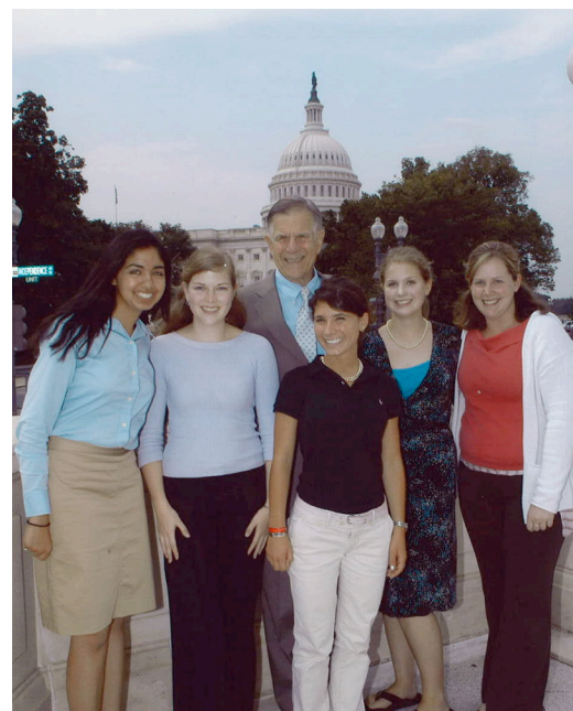
Above: Congressman Stark with interns who worked in his Washington, DC office.

Each year, Congressman Stark recommends a select group of high school graduates for admission to the U.S. Army, Navy, Air Force, and Merchant Marine service academies. Applicants must be residents of the 13th Congressional District and between the ages of 17 and 22. The deadline for requesting a nomination is October 31 each year. Call Stark's district office (510) 494-1388 for additional information.