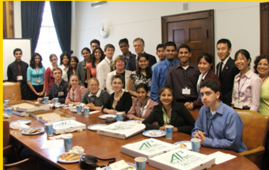
Above: Congressman Stark hosts a pizza luncheon for students from Irvington High School to discuss issues affecting young people today.

Congressman Stark has sent several letters to President Bush and cosponsored multiple resolutions calling for the immediate withdrawal of American troops. The war is a critical issue facing our nation. It's important to stay informed; talk to your classmates, read the newspaper and form your own opinions.