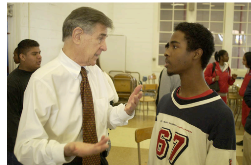
Congressman Stark discusses options available to students seeking financial aid for college.

In order to be eligible for federal student aid, you must fill out the Free Application for Federal Student Aid or FAFSA. The FAFSA determines your eligibility for federal financial aid as well as scholarships, grants and other aid opportunities.