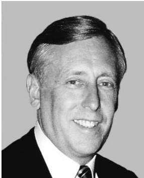
Steny H. Hoyer of Mechanicsville (5th District) Democrat—11th term