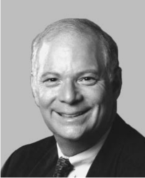
Benjamin L. Cardin of Baltimore (3d District) Democrat—8th term