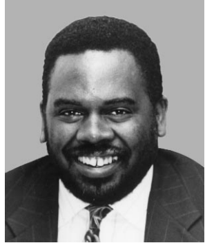
Albert Russell Wynn of Largo (4th District) Democrat—5th term