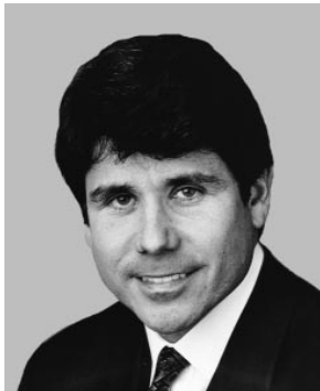
Rod R. Blagojevich of Chicago (5th District) Democrat—3d term