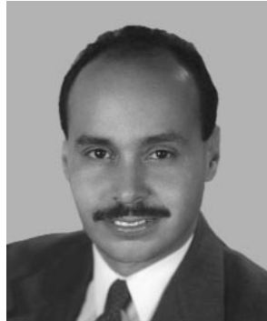
Luis V. Gutierrez of Chicago (4th District) Democrat—5th term