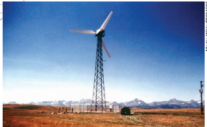
The 100-kW Vestas turbine at Blackfeet Community College near Browning, Montana, provides revenue for the college and serves as a learning tool for students.

Many other Native American communities in the Great Plains also have electrical loads that could be partially met with wind power. Since 1995, the U.S. Department of Energy (DOE) has provided grants to fund projects that explore the potential for large-scale development. The Blackfeet Reservation has hosted two such projects: a 100-kilowatt (kW) demonstration turbine at Blackfeet Community College and four 10-kW turbines that provide supplemental power to the Town of Browning Wastewater Treatment Facility. The data and lessons learned from these projects may help other Tribes contemplating similar projects.