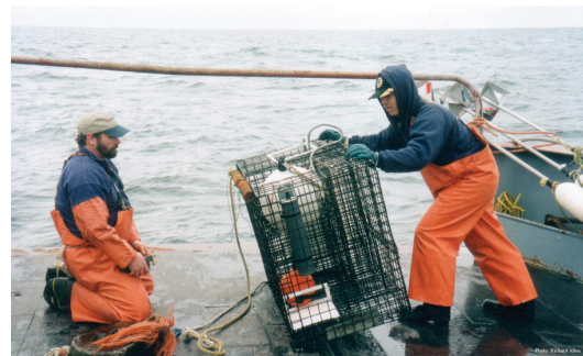
Two fishermen rigging their trap with an acoustic release device.

In an effort to reduce the number of large whales that die as a result of ship strikes, NOAA added new recommended traffic routes to nautical charts for vessels entering or departing the ports of Jacksonville and Fernandina, Florida, and Brunswick, Georgia, as well as Cape Cod Bay, Massachusetts. The recommended routes are designed to reduce ship strikes but also take into account safety of navigation and economic impact to mariners. Right whales typically travel south in the winter from waters off Canada and New England to calving and nursery areas off Florida and Georgia. In the spring, females and their calves return to feeding grounds in Cape Cod Bay. Both journeys involve traversing heavily used shipping lanes. The recommendations also include proposed speed restrictions of 10 knots or less in three major regions of the East Coast. The measures were developed as a result of extensive discussions with stakeholders including the shipping industry.