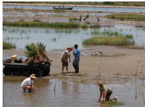
Volunteers at a Wisner salt marsh planting.

In 2006, NOAA celebrated the 10-year anniversary of the Community-based Restoration Program. The program started in 1996 with a few small coastal restoration projects and now funds over 200 projects per year. The program tackles large and small-scale projects including complex dam removals and coral reef repairs. Citizen and partner involvement is the cornerstone of this highly successful program, which restored over 6,000 acres of habitat and opened 70 miles of streams for migratory fish in 2006. National and regional partners including non-profit organizations, state and local governments, and community groups provide additional leverage and expertise in implementing habitat restoration projects. Over the program's 10-year history, almost 120,000 volunteers have participated in on-the-ground restoration projects that improve coastal and marine habitat.