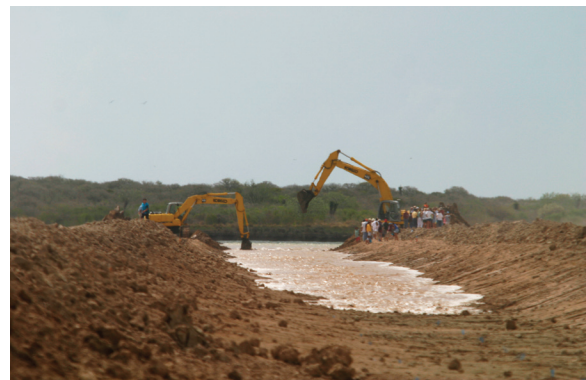
Restoration of the Bahia Grande Estuary. — Carrie Robertson.

The Bahia Grande is an 11,000 acre complex of three estuarine basins, which were once a highly productive shallow water system. In the 1930's, the Port of Brownsville dredged the Brownsville ship channel and the resulting spoil banks cut off the water supply for this tidal system. The Bahia Grande was changed into an arid ecosystem, and its drifting sands became the source of numerous health and industrial problems in the Brownsville area.