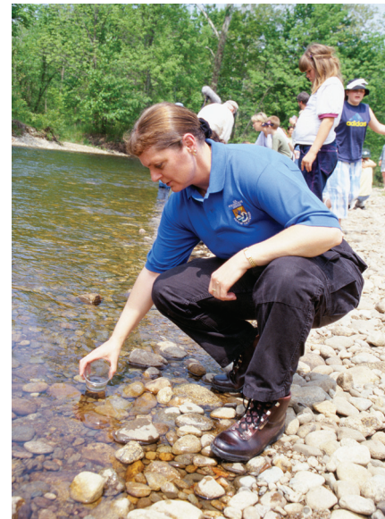
U.S. Fish and Wildlife employee releases endangered Atlantic salmon fry.