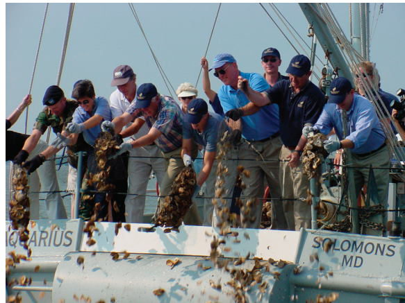
Volunteers dump oyster shells over board as part of a Chesapeake Bay restoration activity.

By the 1970's, it had become increasingly obvious that the Chesapeake Bay was degraded. Bay grasses had died back to a fraction of their historical coverage, large parts of the bay were devoid of oxygen, the water was murky, and some species of fish and shellfish had dramatically declined. Extensive scientific studies were undertaken to determine the causes of the problem. By the early 1980's, there was scientific consensus that nitrogen and phosphorus were the primary culprits. It was also clear that states throughout the Bay's watershed were contributing to the problem. In 1983, the first Chesapeake Bay Agreement was signed by the Governors of Maryland, Virginia, and Pennsylvania, the District of Columbia, the Chesapeake Bay Commission (representing the legislative bodies of those states), and the U.S. Environmental Protection Agency. In 1987, the second Chesapeake Bay Agreement was signed, which affirmed the regional watershed approach adopted in 1983.