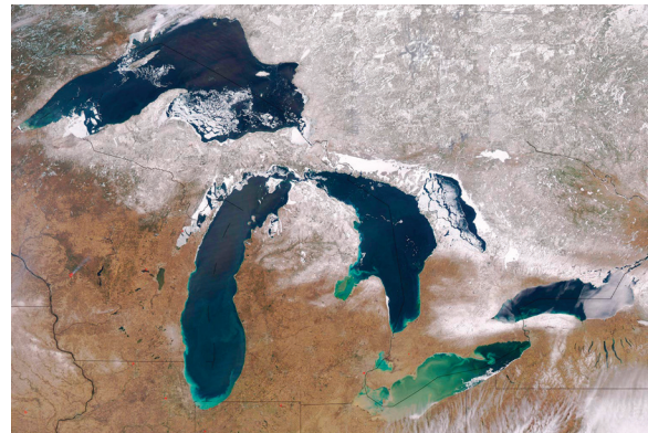
Aerial view of the Great Lakes.

Convened through an Executive Order calling for a regional collaboration to protect and restore the Great Lakes ecosystem, the Great Lakes Interagency Task Force (IATF) was created in 2004. After extensive discussions, the federal IATF, the Council of Great Lakes Governors, the Great Lakes Cities Initiative, Great Lakes tribes and the Great Lakes Congressional Task Force convened the Great Lakes Regional Collaboration (GLRC). The GLRC includes the IATF, the Great Lakes states, local communities, tribes, non-governmental organizations, and other interests in the Great Lakes region. A full list of Task Force Members can be viewed at www.epa.gov/glnpo/collaboration/taskforce/members.html .