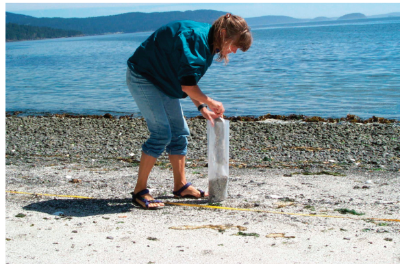
Volunteer for Forage Fish Inventory Project sampling for surf smelt eggs. — Friends of the San Juans