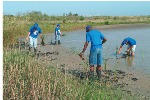
Marsh planting with the Natural Resource conservation Service and Port of Houston Volunteers.

Galveston Bay is home to one of the most productive fisheries on the Gulf Coast and the country's second largest port, Houston. The Houston-Galveston Navigation Channels allow ships to reach the ports in this area. When dredging was proposed to deepen and widen the navigation channels, a controversy was ignited over the potential environmental and economic impacts of dredging and what to do with the dredged material. To address key environmental issues and concerns, the U.S. Army Corps of Engineers (ACE) established an Interagency Coordination Team (ICT), the first of its kind.