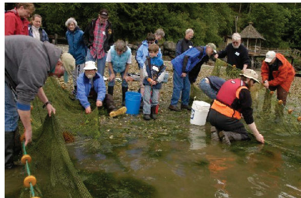
Citizens of Bainbridge Island study the way salmon use the nearshore environment of the region.

As anyone involved with Shared Strategy will attest, one thing those involved with the effort know how to do is throw a party. Picnics are held often on tribal reservations and local beaches to celebrate small achievements and to work through differences. Farmers bring the produce and tribes supply the fish. While many come to the event with arms crossed, they leave with their