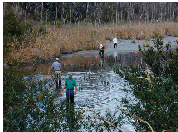
Winyah Bay Focus Area partners at work restoring wetland vegetation.

Another important incentive was helping people understand how large-scale habitat conservation (e.g., conservation easements on private lands) would also help protect and preserve cultural and historical resources, traditional rural land use patterns, and the “way of life” important to local residents. Making this connection was key to facilitating widespread, vocal, public support for conservation in order to influence national, state, and local politics. As a result of this broad-based support, decision-makers responded by directing targeted funding to conserving the area through grants, line items, and earmarks; establishing the Waccamaw National Wildlife Refuge; and by withholding support for new highway projects through the Focus Area.