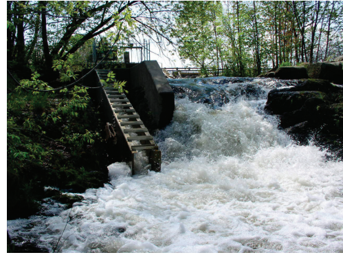
Alaskan steeppass fish ladders installed at Plymouth Pond.

The Coastal Program works cooperatively with federal, state, and local governments, as well as non-governmental partners to protect and restore priority habitat to recover listed species, preclude listing of candidate species, and increase the number of self-sustaining federal trust species. Through its network of field coordinators, the Coastal Program establishes voluntary agreements to provide funding and technical assistance to its partners to support on-the-ground projects in 22 priority areas across the country. An average of three non-federal dollars are leveraged for every federal dollar spent. Since 1994, over 145,000 coastal wetland acres and over 1,400 miles of coastal streams have been restored and over 1.7 million acres of coastal habitat has been protected.