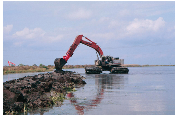
Terrace construction.

The Louisiana Department of Transportation and Development, with the Federal Highway Administration, the Cameron Parish Police Jury, and a host of resource and regulatory agencies, public groups, and private entities, joined forces a few years ago on the Cameron Creole Watershed Marsh Terracing Project. This successful effort used science and an innovative technical approach to mitigate transportation impacts and save an eroding coastal marsh area near Louisiana Highway 27.