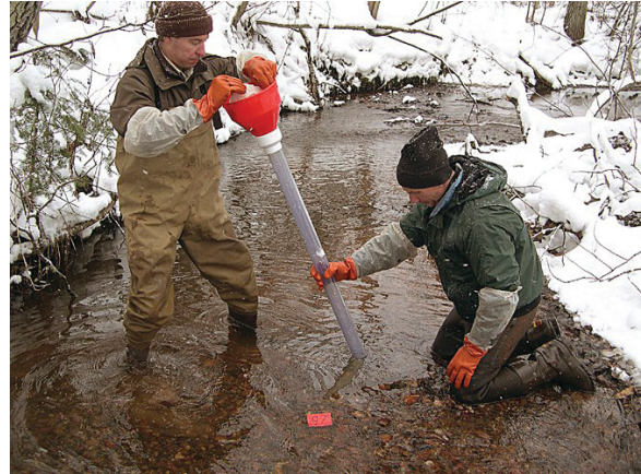
Staff transferring coaster brook trout eggs from a hatchery into a prepared spawning bed in Whittlesey Creek.

As a result, participants in coaster brook trout recovery reads like a “Who’s Who” of Midwest fisheries conservation. The diversity has been a key ingredient to the success of this effort, due to the complexity of jurisdictional responsibility and the technical issues involved. Coaster brook trout habitat spans three states, two countries, and is owned by federal and state agencies, tribes, and private landowners. Compounding these jurisdictional complications, until recently, little was known about the species. Due to these unique challenges, it was important that any effort to recover this species include all players with a stake in the issue as well as those that could contribute technical expertise.