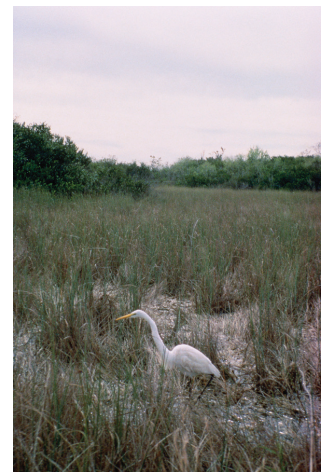
A Great White Egret in the Florida Everglades.

RECOVER is composed of three technical teams. The Assessment Team is primarily responsible for measuring the actual performance of implemented projects and interpreting that performance based on the analysis of information obtained from research, monitoring, modeling, and other relevant resources. The Evaluation Team is primarily responsible for forecasting the performance of plans and the designs relative to desired objectives by using predictive modeling and other tools. The Planning Team is primarily responsible for developing recommendations to improve Plan performance and integrating RECOVER with appropriate planning activities with other agencies.