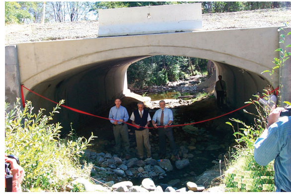
An event at West Weaver Creek to celebrate a fish passage project.

Accomplishments of the Fish Passage Forum include the California Habitat Restoration Project Database, which captures, manages, and disseminates data about habitat restoration projects in California benefiting anadromous fish. In addition to serving as a comprehensive repository for information about California habitat restoration projects, the geo-referenced project locations in the database enable geographical analyses of projects, aiding analysis of past trends and planning of future restoration work. Working with partners, the Fish Passage Forum has surveyed and identified over 13,000 migration barriers, removed 605 barriers (including culverts), opened 95 stream miles by treating or removing culverts, and opened 451 stream miles by removing other barriers. There is substantial evidence of successful fish re-colonization of upstream watersheds.