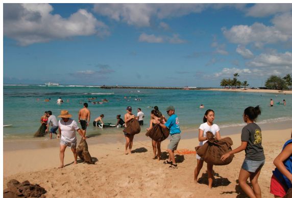
Hundreds of volunteers remove non-native algae from the reefs of Waikiki, O'ahu.

Removing alien algae from high priority coral reefs is key to the long-term survival of Hawaii's reefs and the abundance of life that thrives there. Volunteers have removed more than 88 tons of the alien algae G. salicornia at more than a dozen community-based events over the past three years. The Nature Conservancy recently developed and is testing a floating platform barge with a mechanized removal device, greatly increasing removal efficiency. The University of Hawaii, Waikiki Aquarium, Hawaii Coral Reef Research Initiative, and the Hawaii Institute of Marine Biology are also exploring a new invasive algae control technique using a native Hawaiian sea urchin ( Tripnuestes gratilla ) to graze any remaining invasive algae, and thereby helping to prevent re-establishment after mechanical removal.