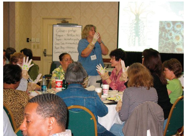
Thanks to a NOAA/National Science Teachers Association (NSTA) partnership, science teachers from around the country learned about current coral ecosystems science and participated in engaging activities in a symposium at the 2006 NSTA national conference.

Federal and state/territory resource management agencies expressed a need for both increased funding and targeted technical assistance to build human capacity for effectively carrying out coral reef outreach and education programs for their residents. NOAA's Coral Reef Conservation Program worked with partners to develop a three-year capacity building initiative that identified training needs, developed regional training workshops and provided two years of follow-up technical assistance from NOAA and outreach experts. Collaborative assessments by jurisdiction and by region focused on gaps in human/staff capacity and available training, rather than on desired projects. Project development was addressed in another branch of the Coral Reef Conservation Program. Funds were awarded to 6 jurisdictions through a small-grant program to address a range of key gaps and development of performance measures. Partners included approximately 60 federal, state, territory government agency and non-governmental partners from American Samoa, the Commonwealth of Northern Mariana Islands, Florida, Guam, Hawaii, Puerto Rico, and the U.S. Virgin Islands, including five National Marine Sanctuaries.