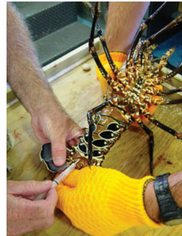
NOAA Fisheries Pacific Islands Fisheries Science Center (PIFSC) researchers aboard a commercial fishing vessel insert sophisticated PIT (Passive Integrated Transponder) Tags into spiny lobster.