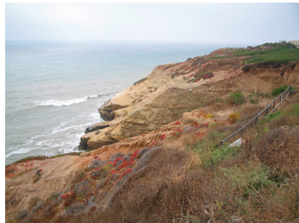
Point Loma Ecological Conservation Area viewed to east across entrance to San Diego Bay toward Peninsula of San Diego. — Andy Yatsko

In 1995, the U.S. Navy (Commander, Navy Region Southwest), in partnership with the U.S. Coast Guard, the National Park Service, Department of Veteran Affairs, and the City of San Diego, entered into a Memorandum of Understanding (MOU) with the U.S. Fish and Wildlife Service in order to minimize the risk for loss to ecosystems on Point Loma from the cumulative effects of development and other land use. The MOU among the Point Loma land-owning partners