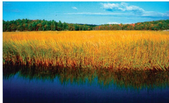
Kennebec Estuary, Maine.

The Maine Wetland Protection Coalition has taken the lead in spearheading wetlands conservation in Maine. The Coalition is comprised of partners including the U.S. Fish and Wildlife Service Gulf of Maine Coastal Program, Maine Department of Inland Fisheries and Wildlife, The Nature Conservancy, Maine Coast Heritage Trust, Ducks Unlimited, Inc. and Trust for Public Lands. Established in 1989, the Coalition works to implement wetland conservation priorities of the North American Waterfowl Management Plan in Maine, using funding from the North American Wetlands Conservation Act.