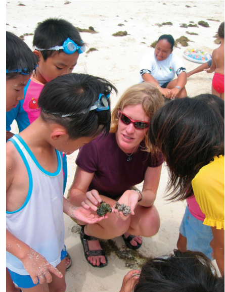
A Coral Reef Conservation Program Fellow conducts a children's marine education program as part of the Commonwealth of the Northern Mariana Islands' (CNMI) Local Action Strategies public awareness initiative.