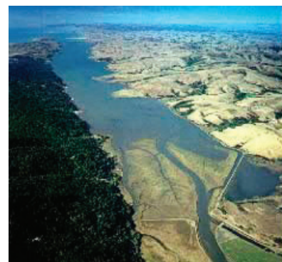
Aerial view of Tomales Bay.

The Tomales Bay Biodiversity Inventory (TBBI) engages students, teachers and the community to experience the scientific process first-hand and contribute high quality data to local conservation efforts. The TBBI was launched to discover and inventory the organisms occurring in Tomales Bay, which is adjacent to Point Reyes National Seashore. The project is the only one of its kind on the West Coast. Its goal is to inventory, identify, and describe the thousands of species found within the bay waters and along the shoreline. The TBBI is also developing