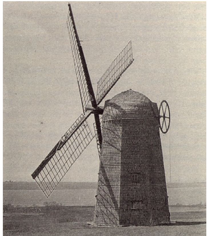
Sherman Grist Mill c. 1900 on the site of what is today Portsmouth Abbey School, Portsmouth, RI.

The Abbey’s monastery and school are located on a beautiful 200-acre property. Everyone’s biggest concern was, “What will this look like?” Everyone thought that wind as an alternative and