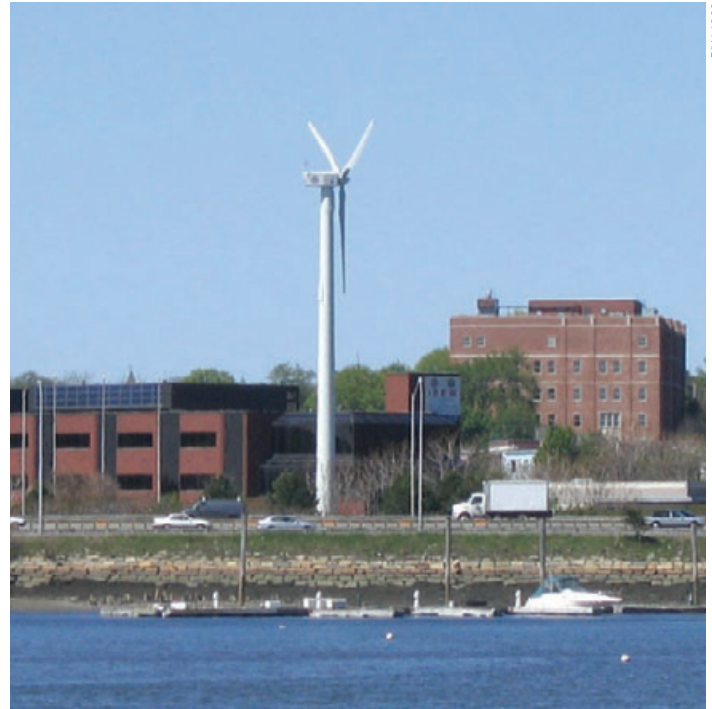
Fuhrlander FL100 wind turbine at the IBEW Local 103 headquarters, Dorchester, MA

Catamount Energy's Glebe Mountain project, envisioned as a 27-turbine wind farm in Londonderry near Magic Mountain, has run into some snags. The Londonderry Select Board voted on October 17 to adopt the Londonderry Planning Commission's new Town Plan that prohibits large-scale wind generation facilities within the town's Resource Conservation Overlay District, which includes the proposed Glebe Mountain site. In a newspaper interview, Catamount Engineering's managing director indicated disappointment but vowed to pursue the project despite the vote.