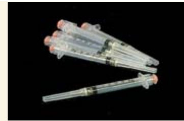
Prefilling syringes is generally discouraged.