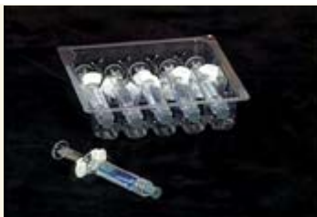
Manufacturer-supplied prefilled glass syringes.

Manufacturer-filled glass syringes are available for a variety of vaccines. NCIRD does not have a preference for specific vaccine brands or product presentations; either vials or manufacturer-filled syringes (when available) are acceptable for use, depending on the preferences of your practice. Manufacturer-filled syringes are an alternative to prefilling syringes yourself. These syringes are prepared under sterile conditions that meet standards for proper handling and