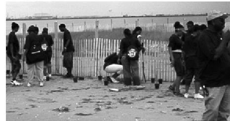
Volunteers Placing Plants Along Coastline

During June, 2003, a group of Earth Team Volunteers, high school students and college freshmen participated in the BAYOU Program (Beginning Agricultural Youth Opportunity Unit) associated with Southern University in Louisiana. Southern University and NRCS have an agreement to provide agricultural information and experience to the students, with the goal of guiding them toward an agricultural career. The group stayed at the NRCS Plant Materials Center in Galliano, LA., and received valuable information on careers with USDA NRCS, FSA and RD. The group donated their time planting Blue Stem, Sea Oats and Bitter Panicum along the coastline at Foucheon Beach, Terrebonne Parish in Louisiana.