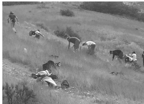
Earth Team Volunteers Help Eliminate Yellow Starthistle

On Saturday, June 21 st , 50 Earth Team Volunteers donated over 250 hours pulling Yellow Starthistle on the mountain above Pleasant Grove, Utah. It was a multi agency effort and considered a huge success. A grant was administered through the Uinta Headwaters RC&D for the project. NRCS donated Earth Team fanny packs that were filled with necessary items, such as sun screen and energy bars. The volunteers were also given a hat and lunch certificate. Forty of the volunteers from the Oakley Boarding School donated their Saturday to the worthwhile project. Thanks to Earth Team Volunteers, there was a huge dent made in Utah's population of the noxious Yellow Starthistle.