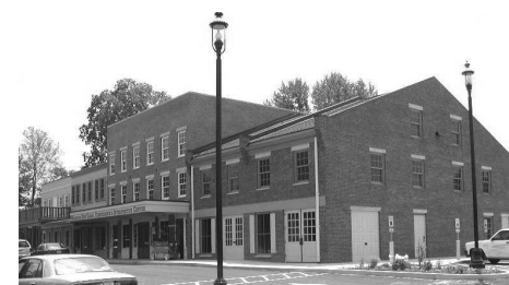
Carroll County Interpretive Center

On Saturday, June 7, 2003, 130 Earth Team Volunteers in Carroll County, IN, were recognized for their hard work the past year on making preparations for the July 4 th grand opening of a new Wabash and Erie Canal Interpretive Center. The volunteers were treated to a 'sneak preview' of the new center as part of the recognition ceremony.