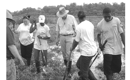
Earth Team Volunteers Collect Wetland Site Plants

A 319 Grant was secured to build an NRCS-designed wetland to study runoff from approximately 400 acres of agricultural land from the Red River Research Station. Research data obtained from this project will provide information in water quality as it filters through the wetland. The results will determine if this project could be used to help clean up water runoff from agricultural land before it is discharged.