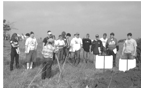
Judging By Volunteers

The idea of a land judging contest was invented by three Oklahoma Conservationists in 1942. They decided which soil qualities could be judged and developed score cards to test skills. The idea caught on, and Oklahoma City has been hosting the national contest since 1952.