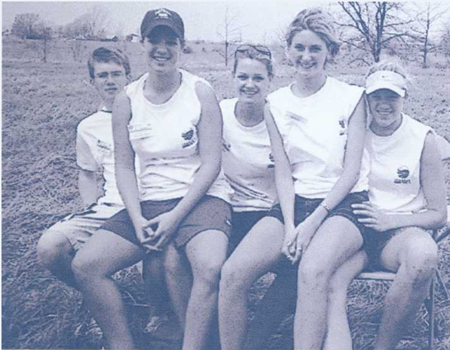
Earth Team volunteers from Villa Grove High School take a break from Earth Day activities.