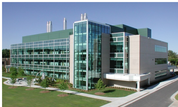
The Environmental Health Laboratory building where the botulinum toxin detection method was developed.

Using mass spectrometry technology, scientists at CDC's Environmental Health Laboratory developed a much faster method for detecting botulinum toxin in people. This method reduces testing time to about