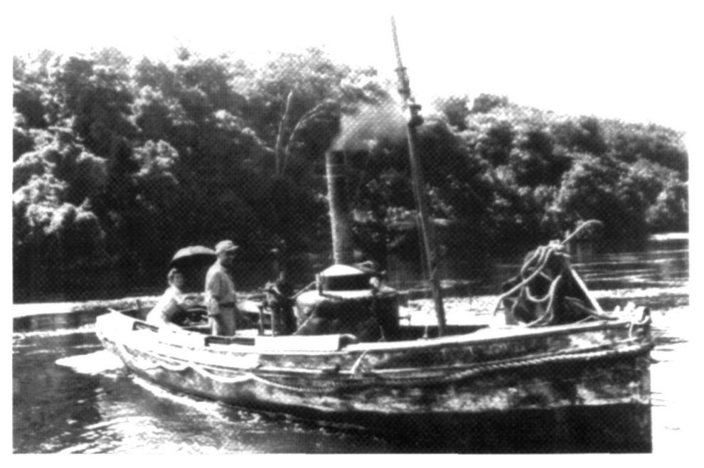
Built in 1912, the AFRICAN QUEEN did not achieve fame until 1951 when it played a starring role in the hit film of the same name. The vessel is currently located in Monroe County, Florida.