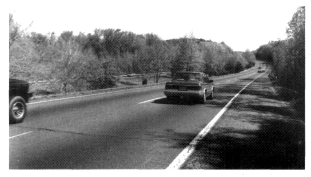
The Baltimore-Washington Parkway in Anne Arundel and Prince George's counties, Maryland, was constructed between 1942 and 1954 as a component of a national parkway system.