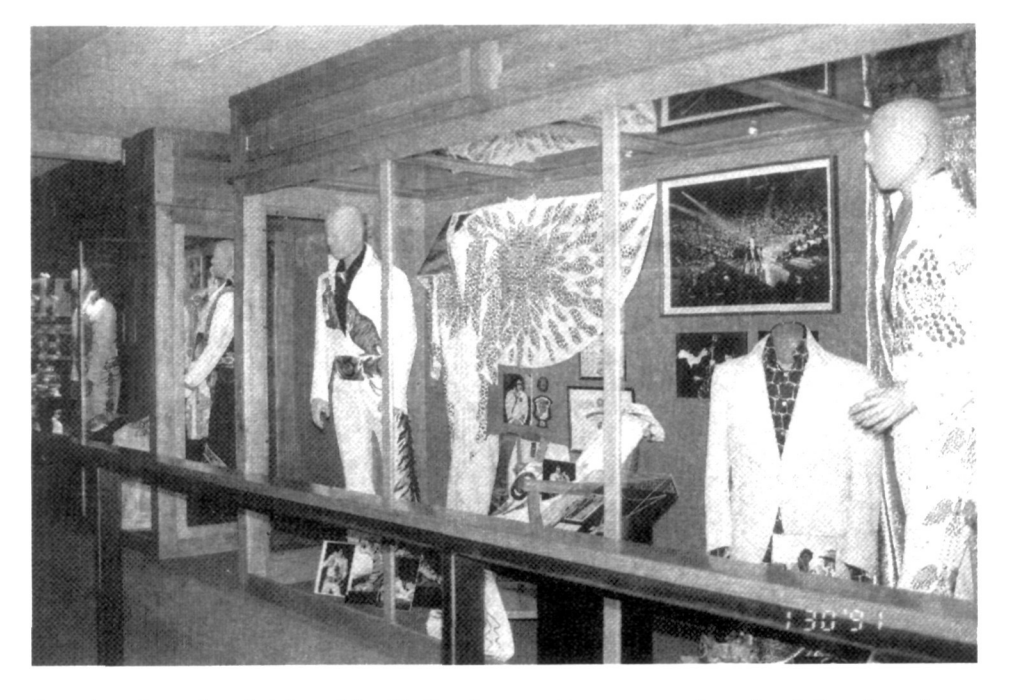
Interior, Graceland, Memphis, Shelby County, Tennessee. Graceland, listed on the National Register in 1991, is exceptionally significant because of its association with Elvis Presley, who revolutionized popular entertainment in the United States during the 1950s and 1960s.