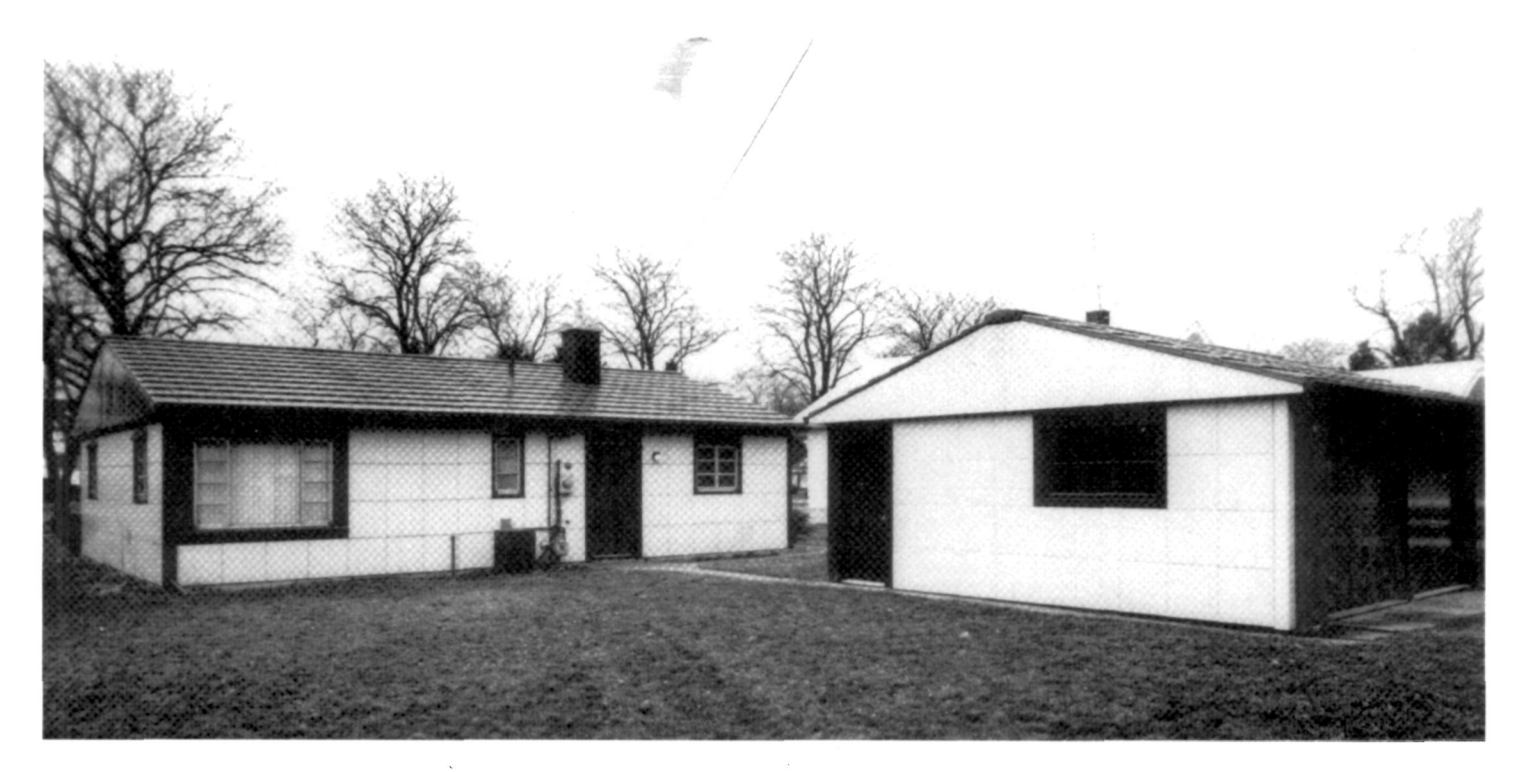
Completed in the spring of 1950, this pre-fabricated, all-metal Lustron House, Porter County, Indiana, was considered by many at the time to be the house of the future. (Beverly Overmeyer, April, 1992)

It is often challenging to evaluate architectural properties of the post-World War II era one at a time. Several States have effectively used a thematic approach and the Multiple Property Documentation Form to evaluate and nominate groups of properties that usually qualify under Criterion C as examples of particular architectural styles or methods of construction. The National Register listed several residences in North Carolina nominated under the name "Early Modern Architecture Associated with North Carolina State University School of Design."