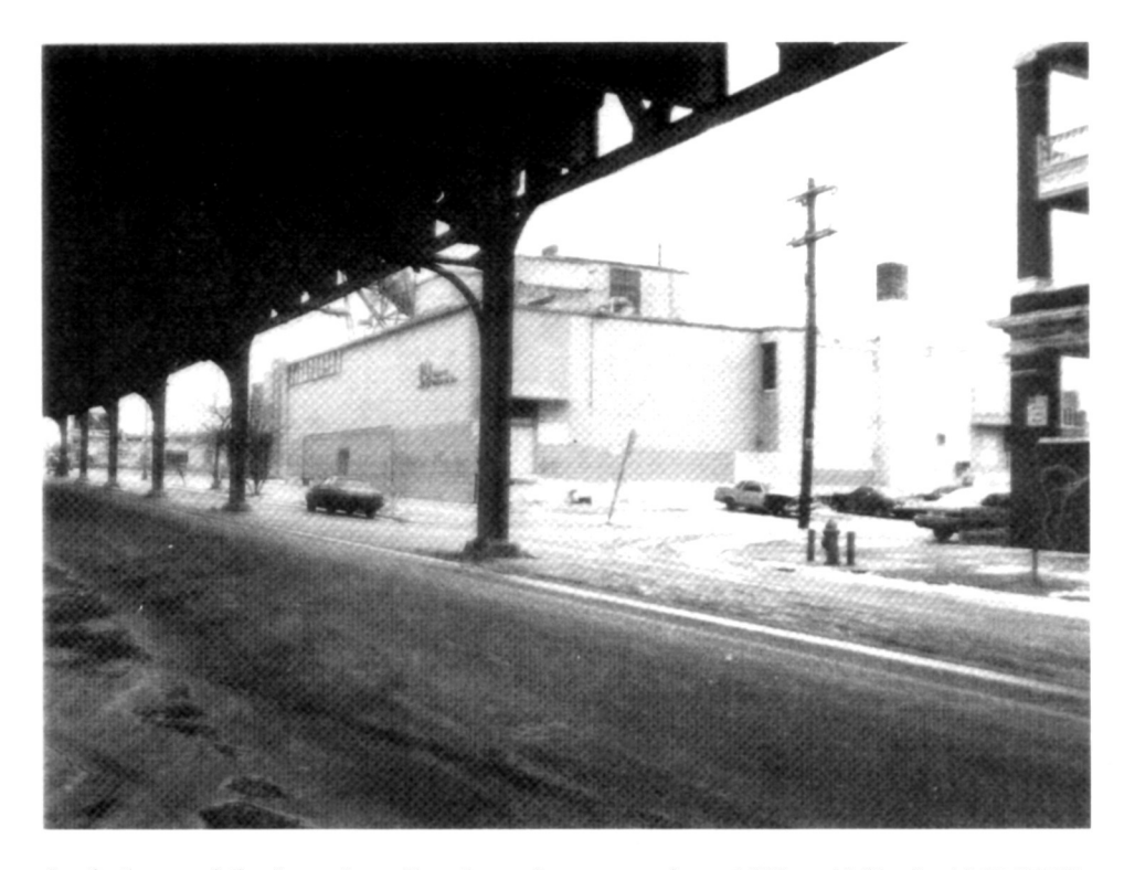
As the home of the American Bandstand program from 1952 to 1963, the 1947 WFIL Studio in Philadelphia, Pennsylvania, is exceptionally significant in the early development of the television industry.

nary impact of a political or social event. It may apply to an entire category of resources so fragile that survivors of any age are unusual. It may be the function of the relative age of a community and its perceptions of old and new. It may be represented by a building or structure whose developmental or design value is quickly recognized as historically significant by the architectural or engineering profession. It may be reflected in a range of resources for which a community has an unusually strong associative attachment. Thus a complete list of exceptionally significant resources cannot be prepared or precise indicators of exceptional value prescribed. The following discussion offers guidance for the reasoning and evaluation applicable to properties that have achieved significance in the past 50 years. It also offers direction on preparing Statements of Significance for National Register nominations (Section 8 of the National Register registration form, NPS Form 10-900) of such properties.